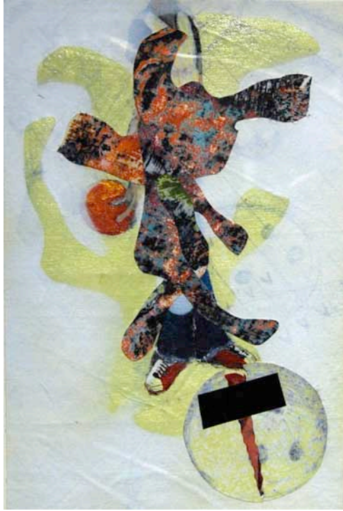
Jeff Rinehart Black 10 x 7 mixed media on canvas