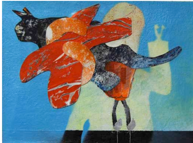
Jeff Rinehart Red 7 x 10 mixed media on canvas