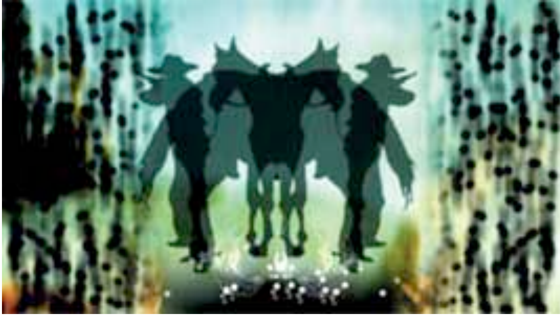
Jeremy Blake Winchester (still) 21-minute video 2002