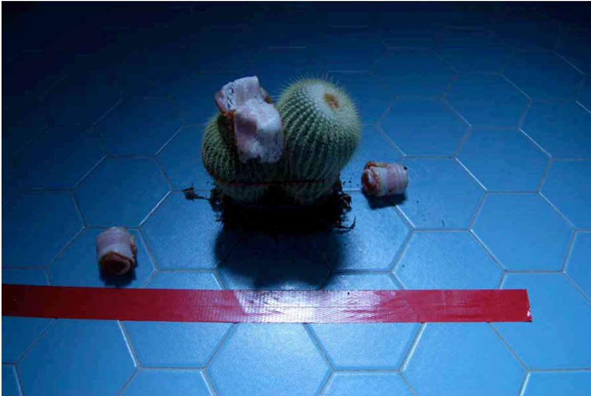
Jeff Rinehart Still from "In Stereo" video mixed media