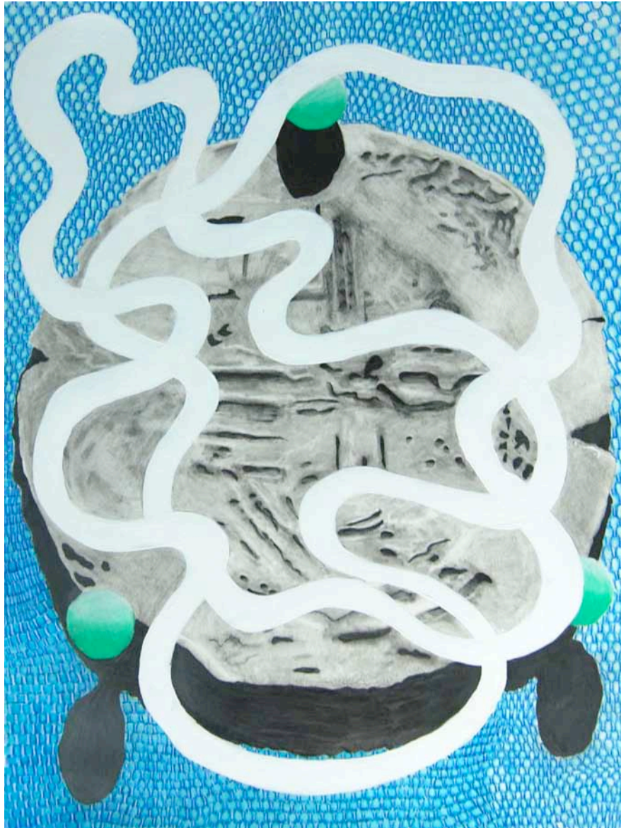
Jeff Rinehart Coins 30 x 22 mixed media on paper