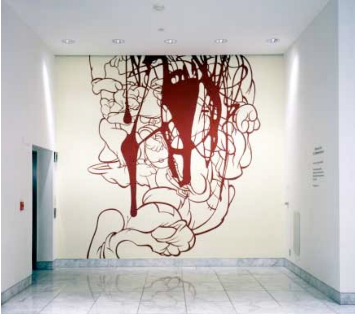
Arturo Herrera When Alone Again Latex on wall installation 2001