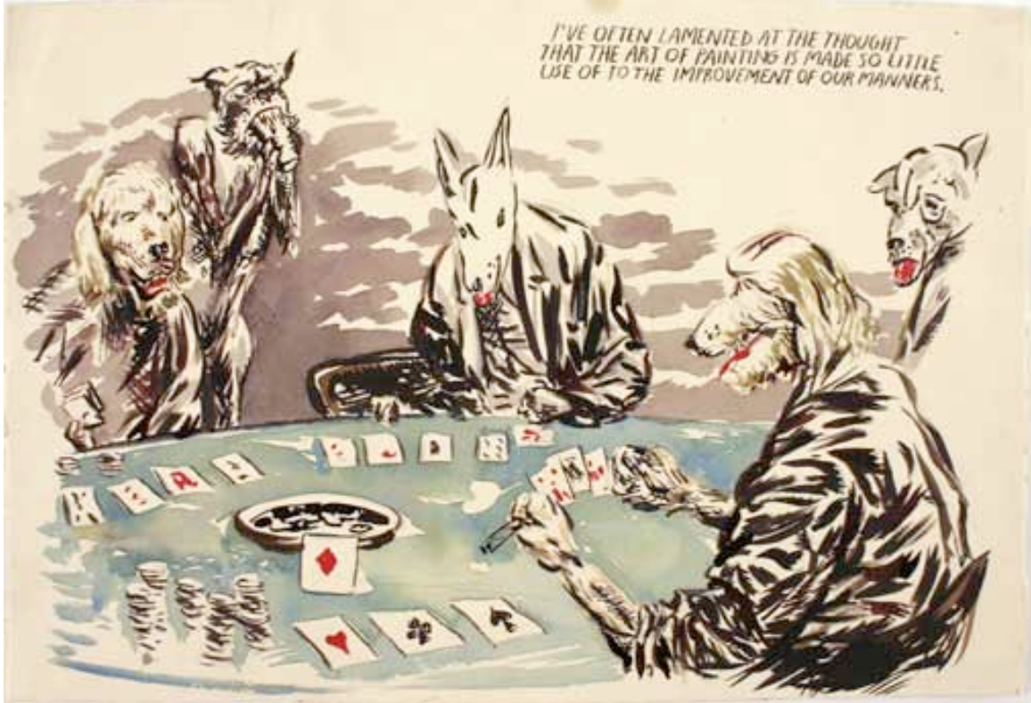
Raymond Pettibon No title (I've often lamented) Ink on paper 2004