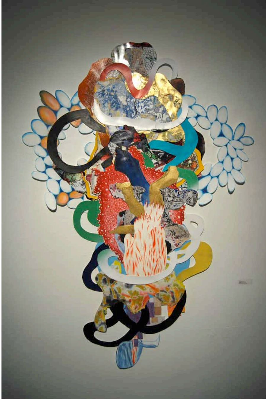
Jeff Rinehart Upward Swing 60 x 36 mixed media on paper