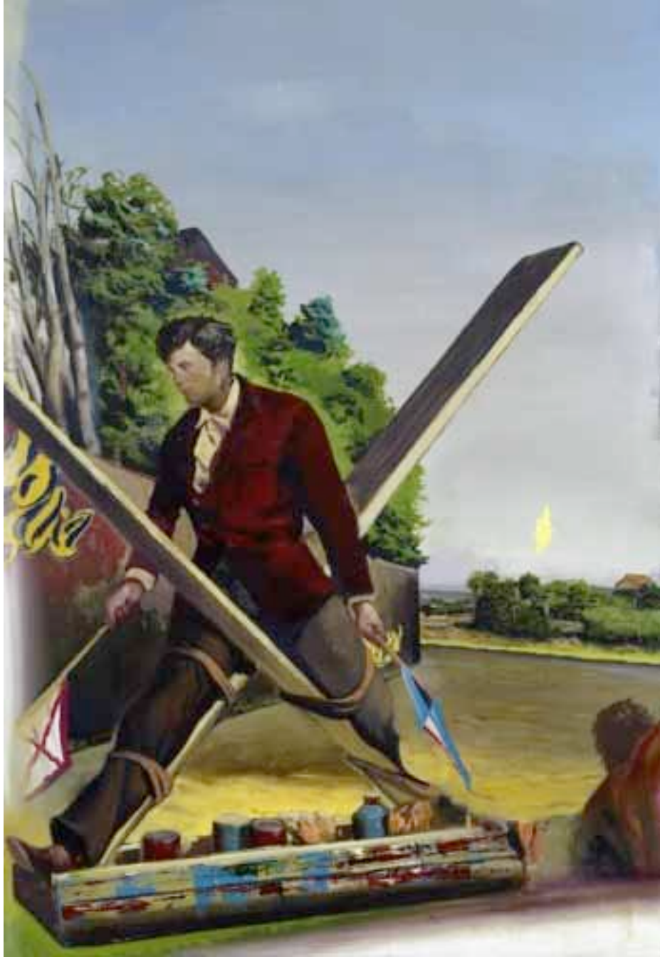
Neo Rauch Die Flamme Oil on canvas 2007