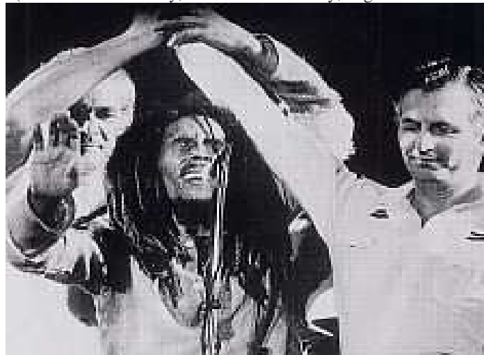
Fig. 1 Bob Marley attempts to unite Jamaican political leaders at 1978 One Love Peace Concert. (left- Michael Manley, Center- Bob Marley, Right- Edward Seaga)

The success of the “One Love Peace” Concert suggested a peaceful resolution of Jamaica's woes. But improvements came slowly. Actual political reconciliation between the two political leaders did not occur as expected and gunmen did not disappear from Jamaican politics. Many now regard Manley's and Seaga's participation in the moment as a mere photo opportunity, rather than a sign of willingness to quell partisan rivalry in the government. In fact, violence between their constituencies increased after 1978. (Only at Marley's 1981 state funeral would the two leaders again join hands.)