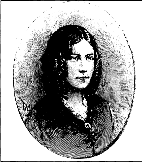
Figure 3: When Harriet Prescott Spofford began her literary career in the pages of the Atlantic in 1858, she received more encouragement than any other female contributor. She was hailed by the editors and reviewers as a genius in waiting, but she waited in vain for the literary immortality they predicted for her. [From William Dean Howells, Literary Friends and Acquaintance . New York: Harper & Brothers, 1901.]

even the poor opportunities allowed them. They have employed the alphabet, as Molière said, chiefly in spelling the verb Amo . . . . And their conception, even of Art, has been too often on the scale of Properzia de Rossi, who carved sixty-five heads on a walnut, the smallest of all recorded symbols of woman's sphere. 9