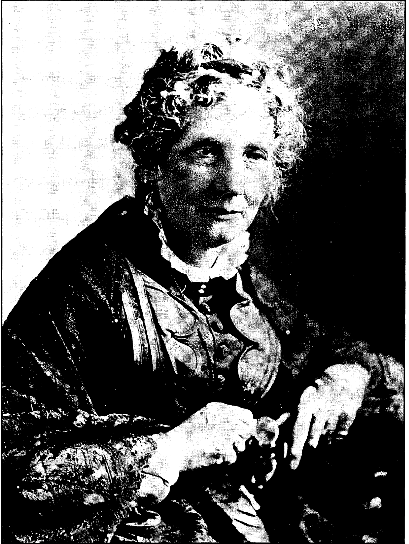
Figure 4: Harriet Beecher Stowe was the Atlantic's most visible and valuable female contributor. She helped launch the magazine by lending her popular appeal to what publishers feared was a roster of mostly stodgy male contributors. Her role at the magazine set the tone for the editors' treatment of other women writers.