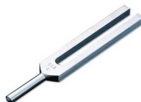
Figure 2. 512Hz tuning Fork