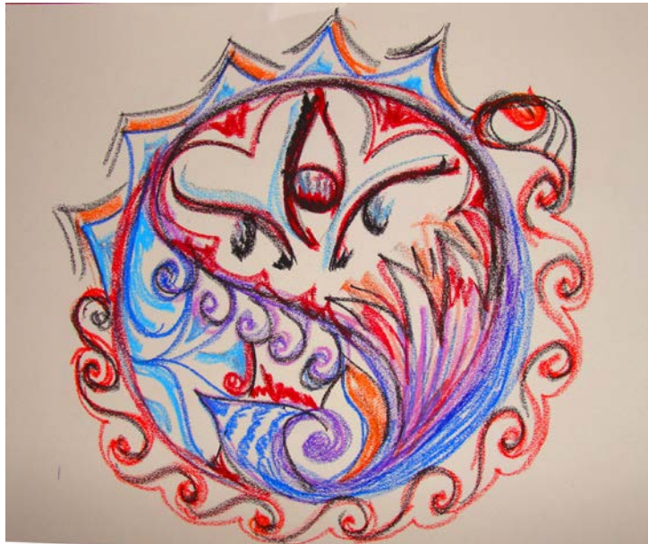
Figure 1. Mandala drawing by Anjali

Next, I chose to play a calmer, supportive piece to end the session. Also from Monsoon Wedding, the song, Your Good Name , is repetitive and gentle, with a haunting melody. It begins with a solo bamboo flute, slow and mysterious with subtle gamakas, or microtonal, ornamental slides. “Oh, I love this song,” she said, recognizing the romantic tune from the film. Immediately, she discarded the red pastel, picked up blue and purple, and created circular, “paisley” patterns in the lower half of the mandala. She told me later that these were reminiscent of the traditional rice paste floor designs she created while growing up in India. As the hints of raga-like melody wound up and down, conversing between sitar and flute, Anjali wove in various shades of ocean blue and lavender throughout her drawing.