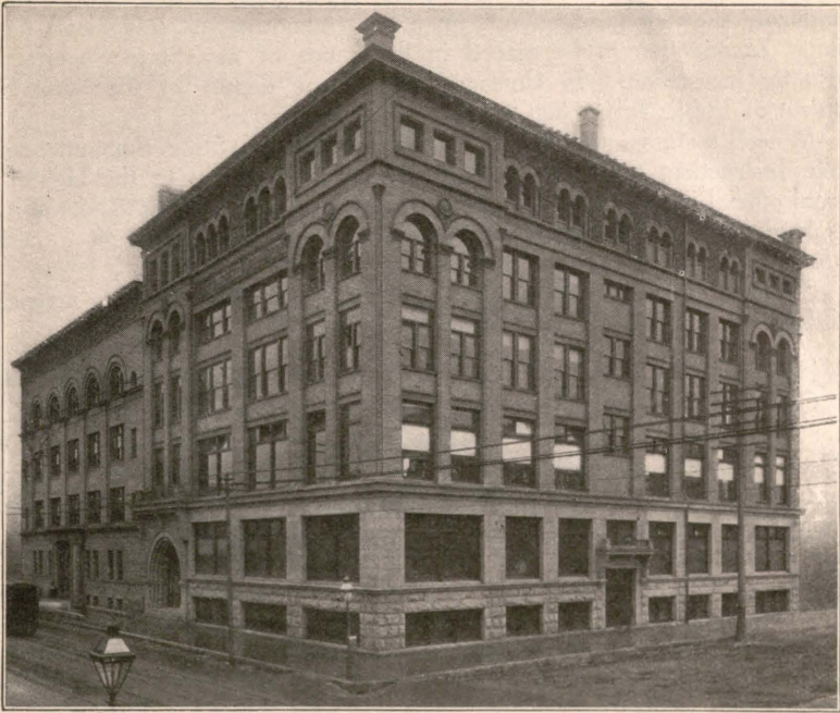
THE COLLEGE BUILDING

The College occupies its own building, which is a five-story and basement structure of Bedford stone, pressed brick and terra-cotta; its location is ideal. Standing in the center of the great medical college and hospital district of Chicago, our students are thus, from the very start of their course, brought into close contact with not only the professional teaching of their own school, but the atmosphere of student life which permeates the entire locality.