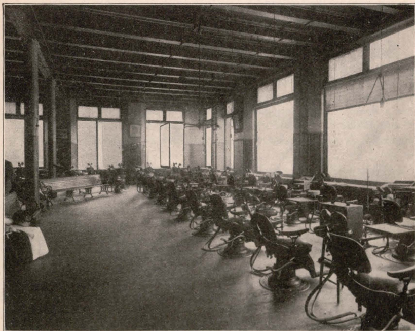
NORTH VIEW OF INFIRMARY—DENTAL COLLEGE