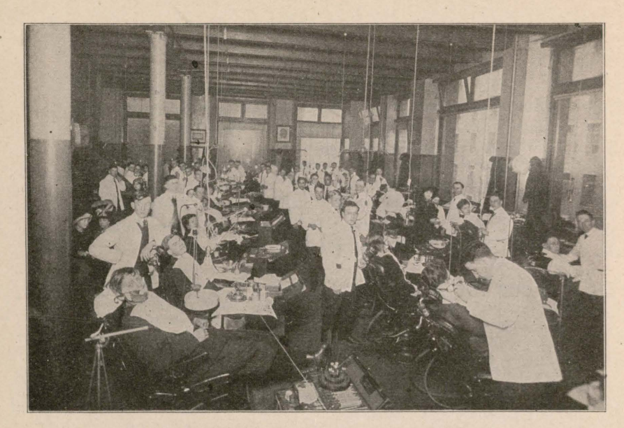
NORTH VIEW OF THE DENTAL INFIRMARY