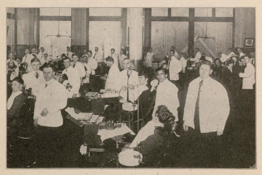
SOUTH VIEW OF THE DENTAL INFIRMARY