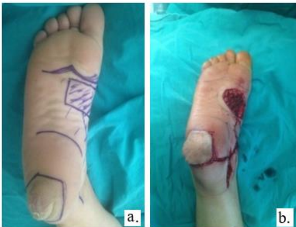
Figure 3. Calcaneal defect following tumor removal – a. flap design, b. flap elevation and placement on the defect.