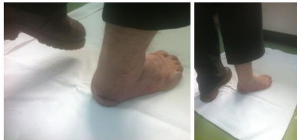
Figure 5. Outcome 2 month postoperatively – full weight bearing.

Reintegration with full weight bearing and normal shoe wearing was possible 2 months postoperatively (Figure 5). There was no evidence of ulcerative or other lesions at flap level 2 years postoperatively.