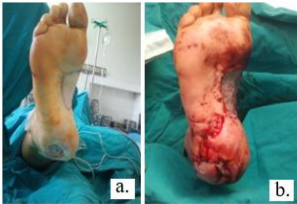
Figure 2. Calcaneal defect (neurologic-type ulceration)- a. flap design, b. defect coverage with sensate insular medial plantar fasciocutaneous flap – immediate postoperative result

The medial plantar artery was exposed by cutting the abductor hallucis muscle and later ligated to the distal edge of the flap (Figure 1). The plantar medial nerve was discovered and dissected to be included into the flap, thus preserving its sensitivity. The flap was elevated from distal to proximal with the inclusion of the neurovascular pedicle. The continuity of abductor hallucis muscle was restored. In all cases, the donor sites were covered by split-thickness free skin plasty and the flap was positioned at the defect level by tunneling in 3 cases and in the other two cases by skin incision and sutured to the defect edges with separate stitches (Figures 2, 3).