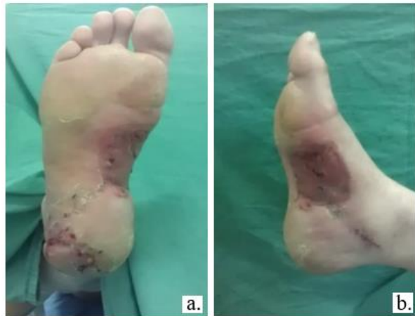
Figure 4. Result at 4 weeks postoperatively: a. flap, b. donor site.

In our study no complications (necrosis of the flap) were recorded. Hospital stay ranged from 7 to 14 days. In all cases we reported good results at 4 weeks after surgery (Figure 4). The morbidity of the donor site was minimal.