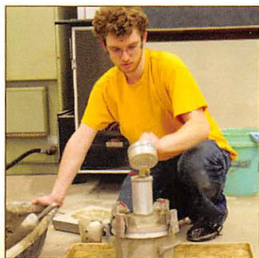
Student recipients of the 2012 Guild Campus Gift Grant for American Concrete Institute Certification.