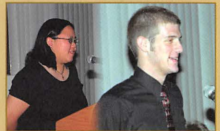
Guild Scholars thanked the membership at Friday night’s dinner during Convention 2000.

Call the Guild Office at 800-748-4538 to order your cookbooks today!