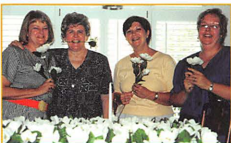
Members of the Atlanta Chapter show off the beautiful magnolia centerpieces they created for the 2000 Convention banquet, "Georgia on My Mind."