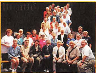
This summer, a group of VU Guild members and alumni visited Germany and Austria. This picture was taken at the Augustinian Cloister in Erhart, Germany where Martin Luther lived and studied.

Buffalo's annual fall dinner was in October and members from the Southtowns of Erie County, North East and Rochester chapters also attended. In November, the Buffalo chapter is having a Borders Benefit