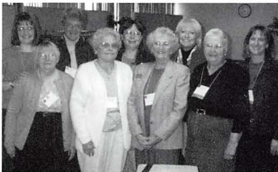
Members join together from across the Four Winds.