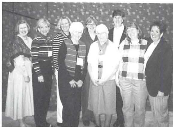
Members of the Milwaukee Suburban chapter gathering at Convention in recognition of their 45th anniversary.

Area V chapters had Valpo in mind this summer...hosting "Summer Send Offs" and making Guild Goodies, baskets for auction and other items for the Convention. Appleton, Madison, Racine and Sheboygan chapters hosted events for current students, prospective students and families. Milwaukee Golden Gems members spent summer evenings making decorative plates for sale at the Convention.