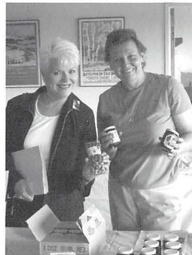
Oregon Trail, OR chapter members display bazaar items.