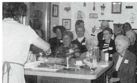
Columbus Capital Bells' members watch a Pampered Chef demonstration.

Medina has started its plant sale using the "certificate" plan. The summer outing will be at a festival at Quail Crest Farm followed by dinner at an Amish Restaurant. Cleveland is planning a 70th year celebration! Happy anniversary! Lorain will join with Cleveland and Medina in the 3rd annual Student/Alumni/Guild picnic in August. Guild women in the Cleveland area assisted at the Lutheran Impact, a local mission project which included youth from four states.