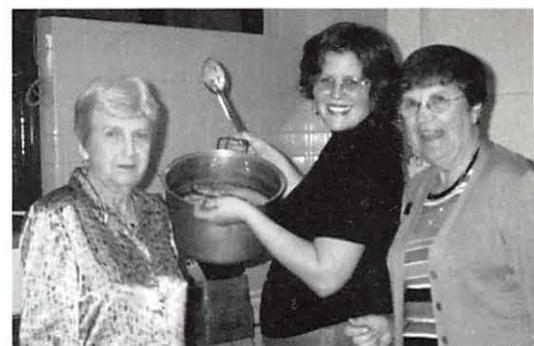
St. Pete's Taster's lunch.