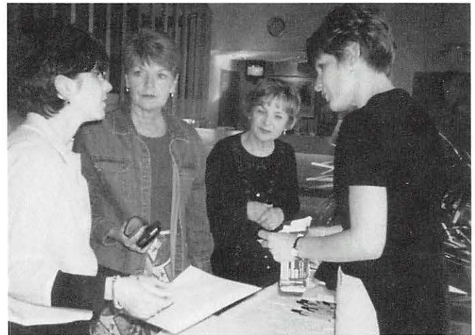
Guild members setting up for Alpha Phi Delta sorority's 85th reunion. One-third of the reunion attendees were Guild members.

It is this spirit of giving that will assist Valparaiso University in meeting its future challenges. Thank you, Guild members, for continuing to make lasting contributions to the progress of the University! 🔥