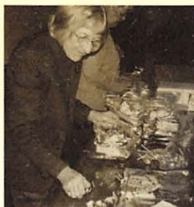
Members of the Milwaukee Suburban chapter assemble care packages for students.