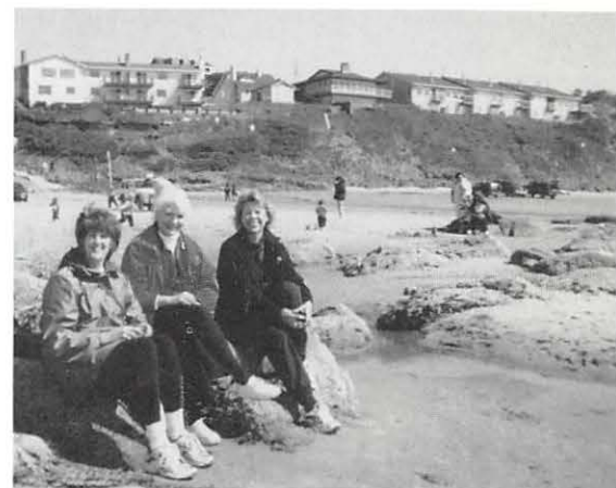
Taking a break on the beach at the Oregon/Washington Guild retreat.