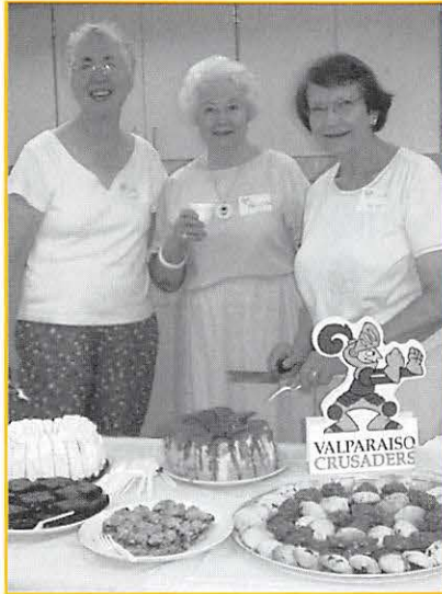
Kansas City members serve up sweets at the Summer Send-off.

Puzzled what to do? Consider gathering to work on a puzzle. Rain or shine, puzzles are a great way to work together and enjoy the company of Guild friends. Use the time to piece together the year's events and discuss fundraising ideas.