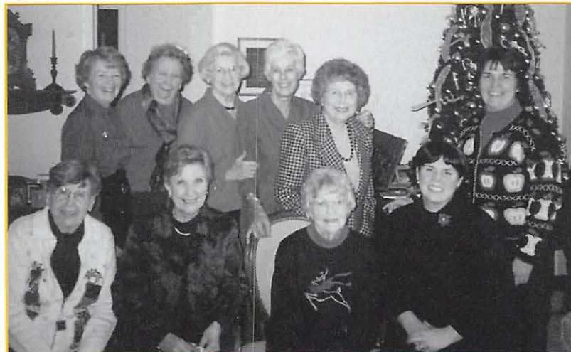
Winter meeting of Battle Creek, MI Guild members.

Four Winds breezes have been blowing up a great deal of enthusiasm and donations. Please encourage non-Guild member Valpo friends to join Four Winds for only $40 a year. That entitles them to four newsletters, a directory, e-mail updates, the Guild Bulletins, and new friendships across the country. Members are eligible to run for national offices and children may apply for Guild scholarships. Thanks for spreading the word about the unique "Four Winds" chapter.