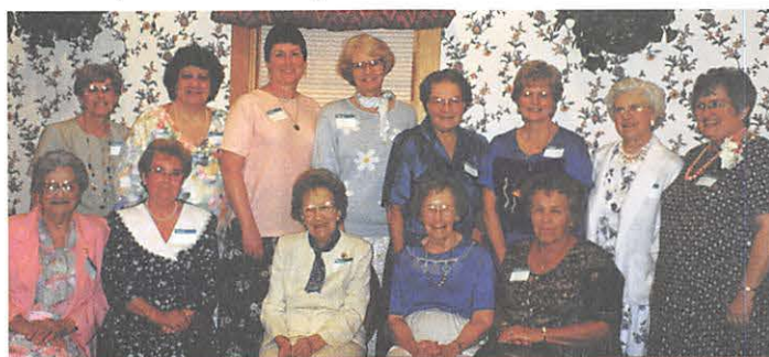
Saginaw Chapter • 65th anniversary celebration