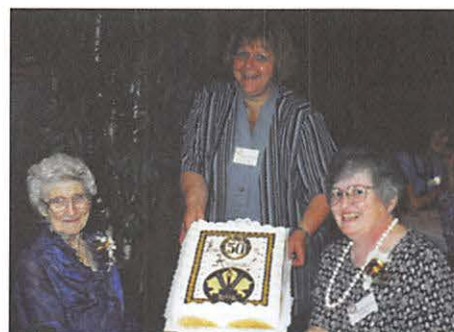
Central New Jersey Chapter • 50th anniversary luncheon

All Area IV chapters continue to remain connected with the students from their areas on campus with notes and snacks.