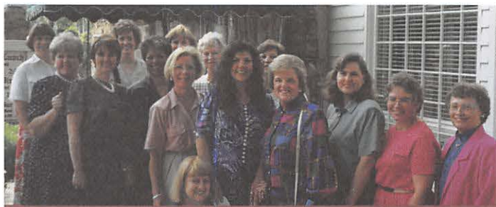
Atlanta Chapter • 25th anniversary luncheon

Membership issues seem to be the top topic of conversation with the chapters in Area VII.