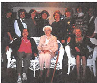
Members of the Washington D.C. Chapter at luncheon meeting

An alumni/Guild Valpo gathering was hosted by the Washington, DC Chapter in May. A t-shirt depicting the chapel windows with "Valparaiso University" on the back and "Valpo" on the front was designed for this event, but will also be available at the Kaleidoscope Bazaar/Silent Auction.