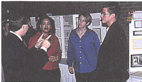
Students and professors at VU's "Celebration of Undergraduate Research" event