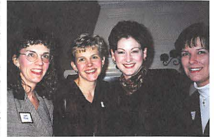
St. Louis Chapter members at luncheon fashion show