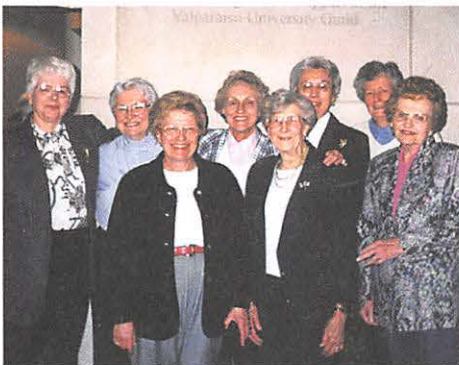
Quad Cities Chapter members on campus this spring

took place at a member's home for "tea," very English, where new students attending Valpo in the fall were welcomed. Next year's theme? - "Pamper Yourself."