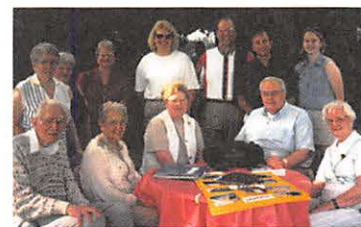
Omaha members at recent chapter gathering

The Naperville Chapter gathered for a House Walk and saw a number of interesting collections ~ Teddy Bear beanies, matchbox cars, animal shaped antique glass candy containers, Boyd Bears and Pez containers. The members then enjoyed a barbecue lunch at a nearby restaurant.