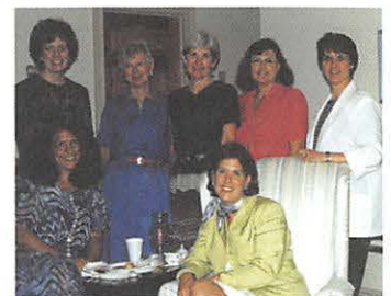
Members of the Atlanta Chapter at a recent celebration