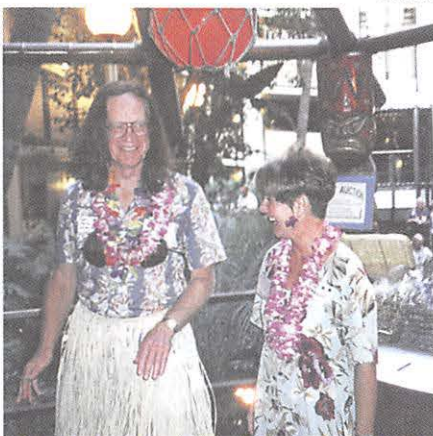
Valpokolani Luau Inu, Homecoming West '98

The big event in Area IV was Homecoming West last October in San Diego where the Crusaders won an exciting football game against the University of San Diego! Many Guild chapters from up and down the West Coast (and inland areas, too) were represented at this festive gathering. The chapters took advantage of the event and sold Guild items and promoted the Guild Market at the "VU Bookstore". On Saturday night, a "Valpokolani Luau Inu", a Hawaiian cocktail