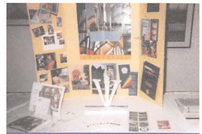
VU Display at "The Dali" event in St. Petersburg

The New Orleans Chapter had a very successful pecan sale during