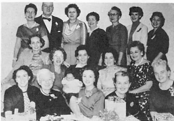
Phoenix Chapter of the Valparaiso University Guild Christmas party, 1960.