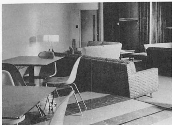
Interior views of Faculty Club