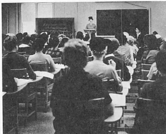
On Saturday morning the business sessions of the Board meeting were held at Heritage Hall.

Special projects and requests might be called "miscellaneous." The varied activities include maintenance of the campus photography file; promotion and administration of the university filmstrips; preparation and supply of exhibit materials for area requests; design, preparation, execution, and administration of large exhibits for national conventions; aiding in promotion and publicity of university events; serving as public relations, publicity, or news counsel wherever requested; filling news requests of all kinds from all sources — individuals, newspapers, radio, television, other schools, and the like, editing university publications; providing copy for other university publications; lay-out and design of pamphlets, brochures, advertising, reports, magazines, and the catalog; serving as press officer in emergency situations and on occasions where unfavorable publicity is imminent; filling special story requests; and