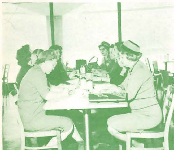
INDIANA PRESIDENTS hold breakfast meeting at Union Cafeteria in February.