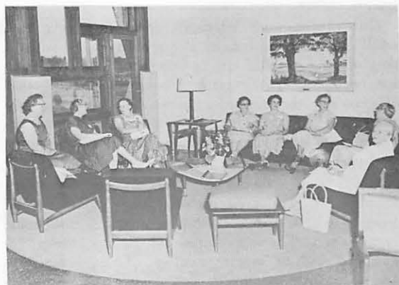
RELAXING at the Union before sessions.