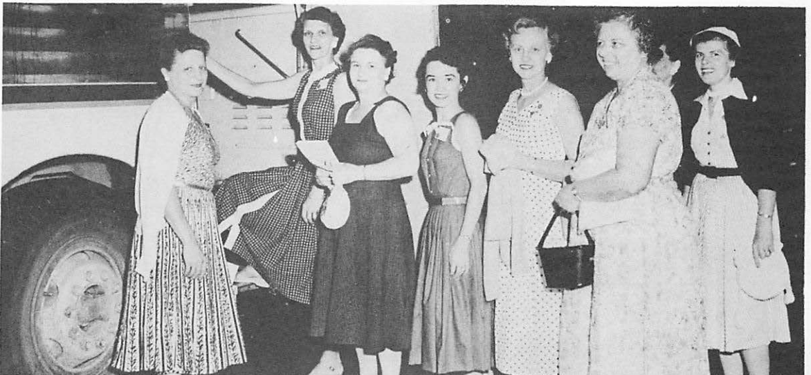
BOARDING THE BUS for the trip to the Dunes—spirits undampened by the rain!

Answer: No, if no objection was made by the members when action was taken, it indicated that the members approved of the consideration of the question.