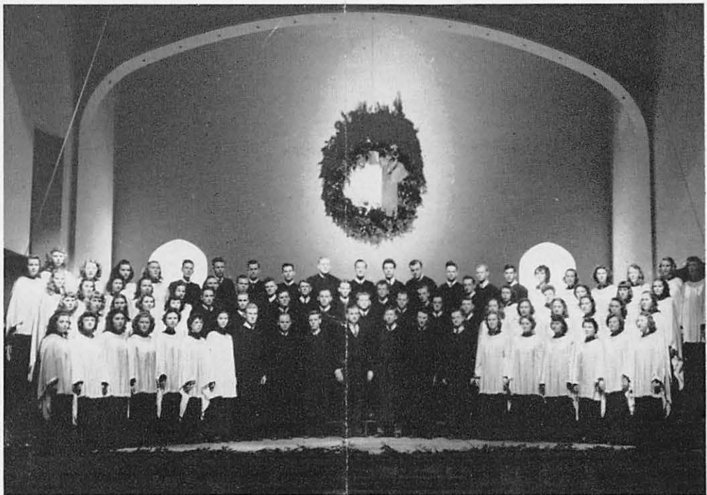
This picture of the Valparaiso University choir was taken on Sunday, December 15, when the choir rendered its annual Christmas concert to a large audience in the auditorium on the University campus. Many members of the Guild will have an opportunity to hear the choir when it goes on tour in February, 1947.