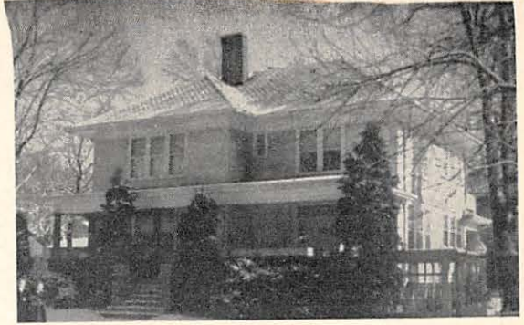
The Health Service of the University is housed in this attractive residence, where one physician and three full-time nurses take care of the students' needs.

"We are now standing squarely in the middle of the 20th century. What will the second half bring? The final answer lies in the mercy