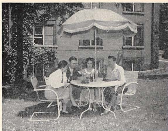
Spring beckons students to the out-of-doors on the lawn south of Altruria Hall.