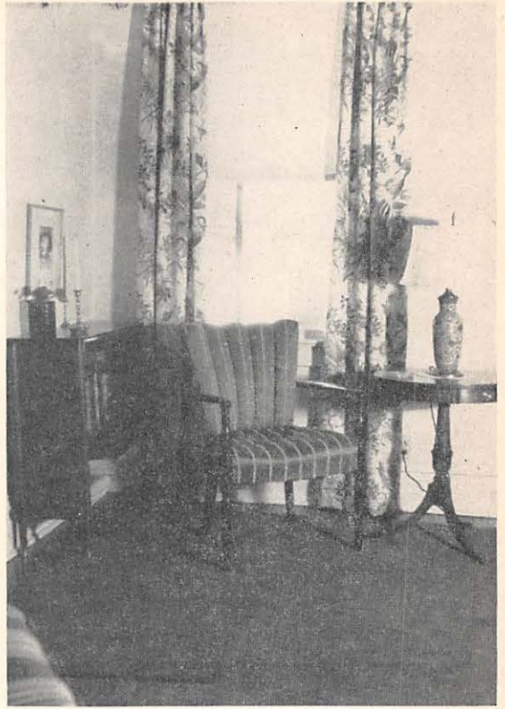
A CORNER of the living room in the Home Economics laboratory.

To show a genuine interest in people and liking for them we must be a good listener. Many persons need someone to listen to their problems. The things they want to talk about may sound silly to you, but it is a real difficulty to the one who wants to talk about it.