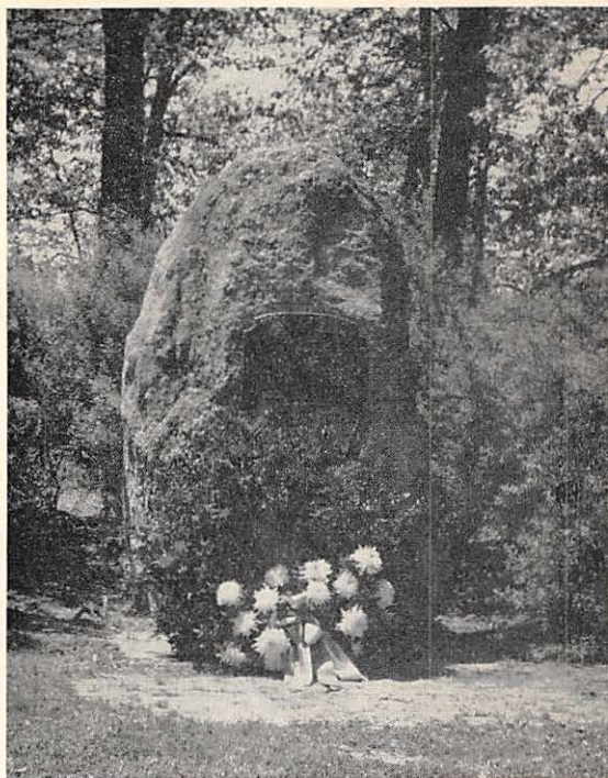
FOUNDERS' ROCK, where ceremonies take place each year on the third Sunday in May, honoring the Founders of Valparaiso University. 1950 marks the 25th year under Lutheran administration.

In well chosen remarks the chairman advocated an unswerving loyalty to the Guild and all that it stands for. She declared that it is our responsibility to keep the lamp of service