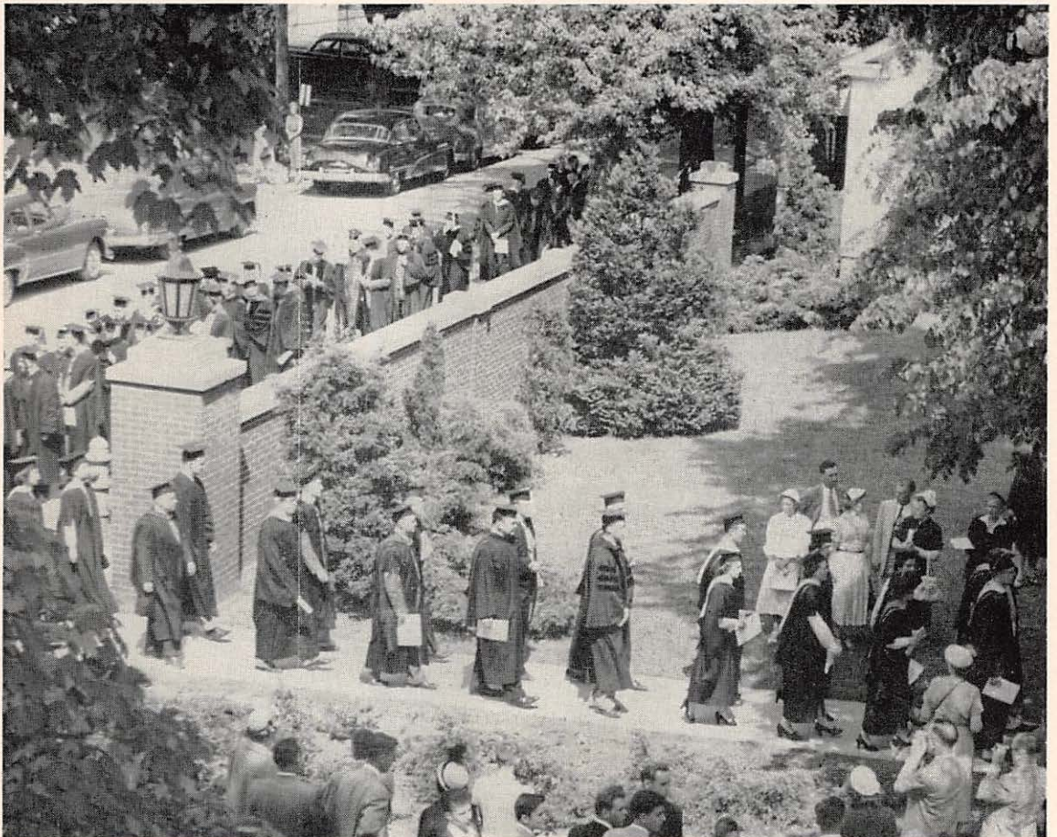
A PART of the academic procession showing members of the faculty on their way to Commencement ceremonies at Valparaiso University on June 1, 1952.

And it is this point, I would suggest, that needs to be constantly re-emphasized in any discussion of the Christian life and of the Christian vocation. God has not called sinners as though they were saints, He has not called men and women of average intelligence as though they were geniuses, He has not called young men and women as though they had no passions, He has not called Italians as though they were Swedes, He has not called people with hot tempers as though they were phlegmatic. This is not to say that God approves of sin or stupidity or lust or hot tempers. It is to say that when God calls a