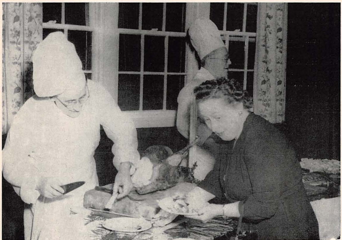
"Another helping of turkey, please."