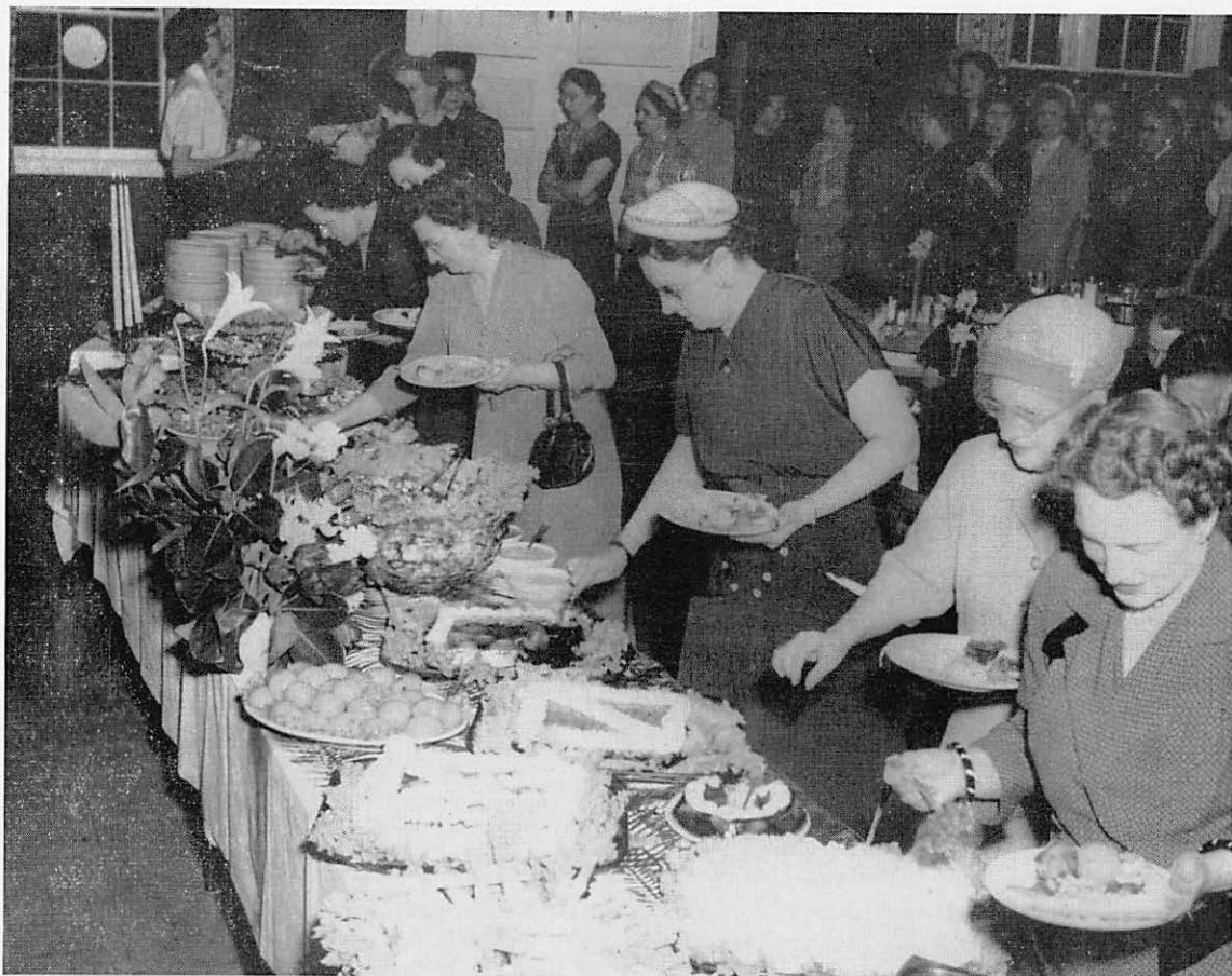
MEMBERS OF THE GUILD helping themselves at Buffet table.