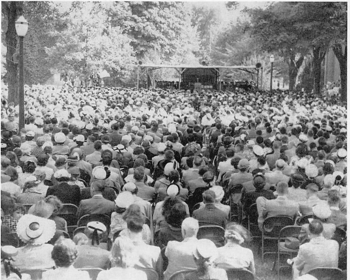
A PART of the audience at Commencement ceremonies, Valparaiso University, on Sunday afternoon, June 1, 1952.

All these I mention not in order to suggest that our own weakness or our own sin is something merely to be accepted or even justified but to illustrate how God is able to use men of