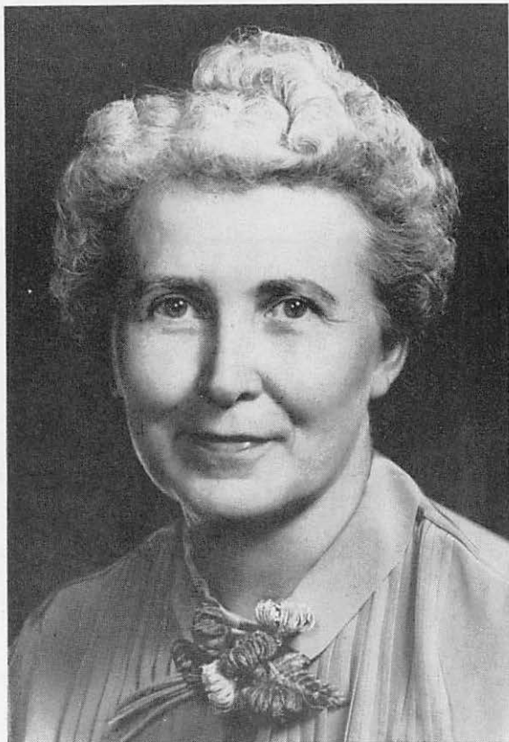
Mattoon, Illinois June 22, 1952