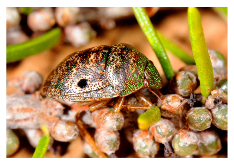
Figure 2. Diolcus\ chrysorrhoeus, adult, collected with the first-instar nymph in Levy County, Florida.