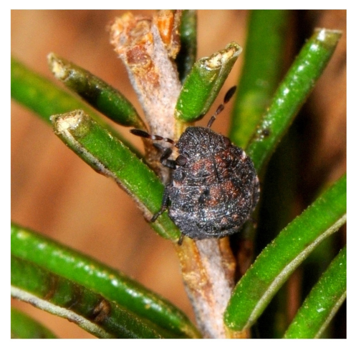
Figure 1. Diolcus chrysorrhoeus , third-instar nymph (collected as instar I), Levy County, Florida, Rt. 27A, 3.7 km SE of Bronson, 18 August 2012.