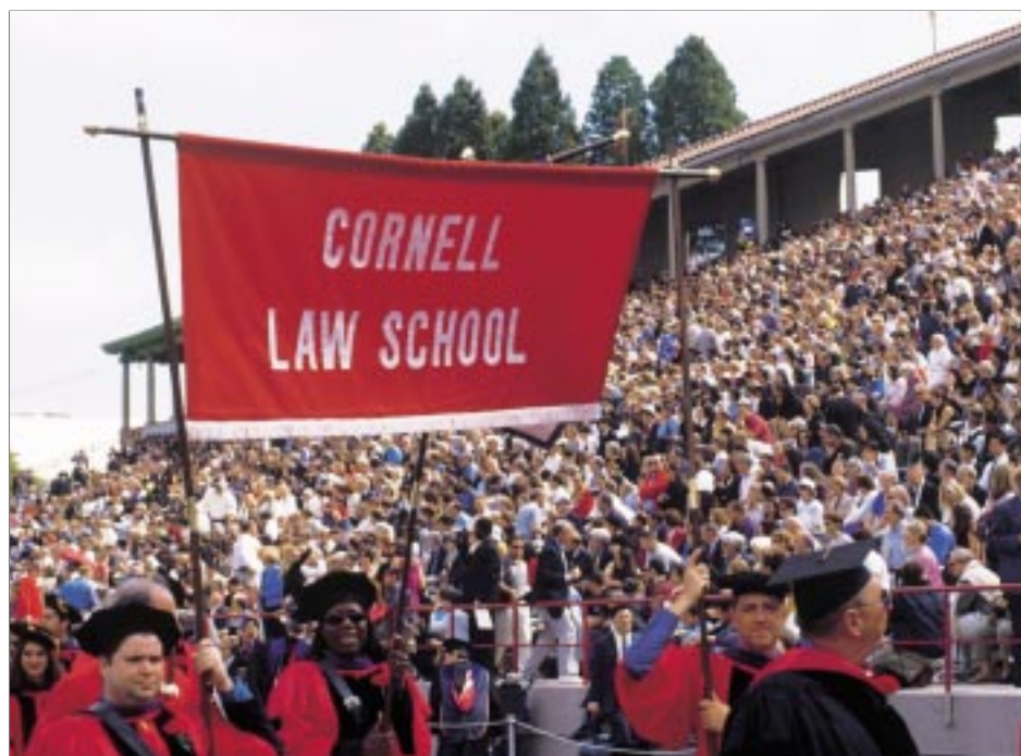
Law school degree candidates entering Schoellkopf field for the graduation ceremonies