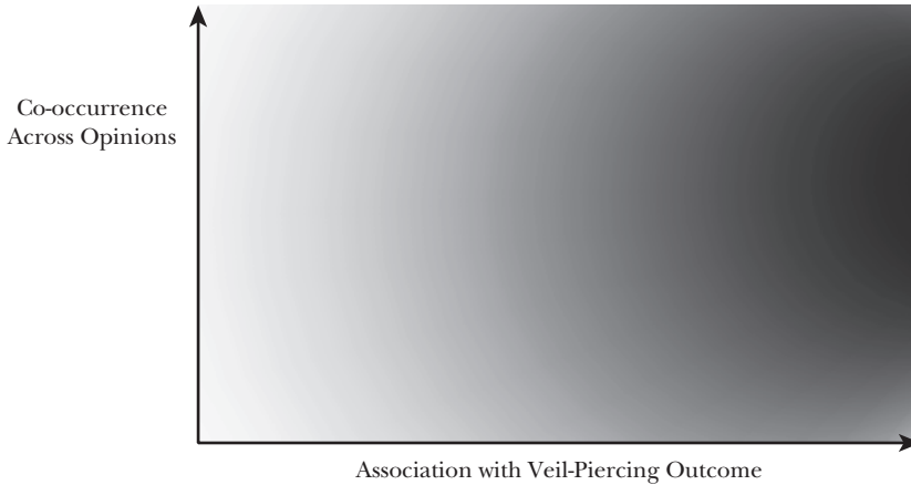
FIGURE 1. VISUAL REPRESENTATION OF DOCUMENT STRUCTURE

The goal of structure discovery is to identify the words and phrases found in the upper-right corner of this figure, i.e., those that are both most predictive of the veil-piercing outcome and tightly related to the same underlying idea(s). In this Part, we apply text analysis to show that our three-part taxonomy best describes the structure of veil-piercing opinions, i.e., the words and phrase found in the upper-right corner correspond more or less to the three rationales we discussed.