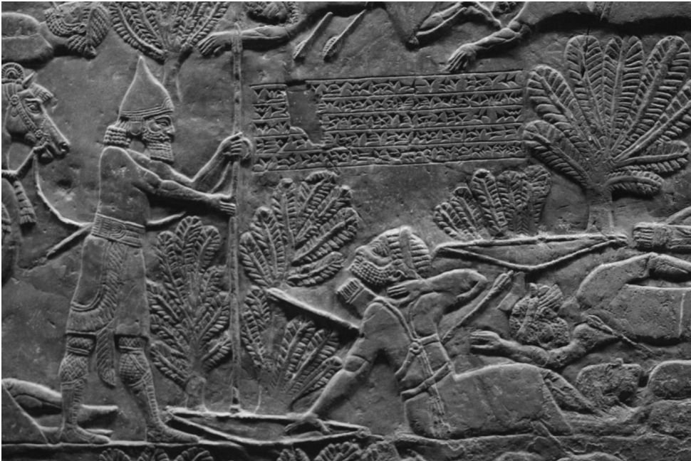
Fig. 16. Urtaku, an in-law of Teumman, calling an Assyrian soldier to decapitate him, from Room XXXIII, Southwest Palace, Nineveh, ca. 660–650 BCE. BM ME 124801b. The British Museum.