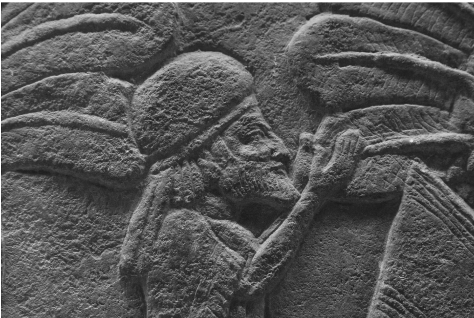
Fig. 4. The first foreigner (the Elamite king, Tammarītu). The middle row of BM ME 124946.