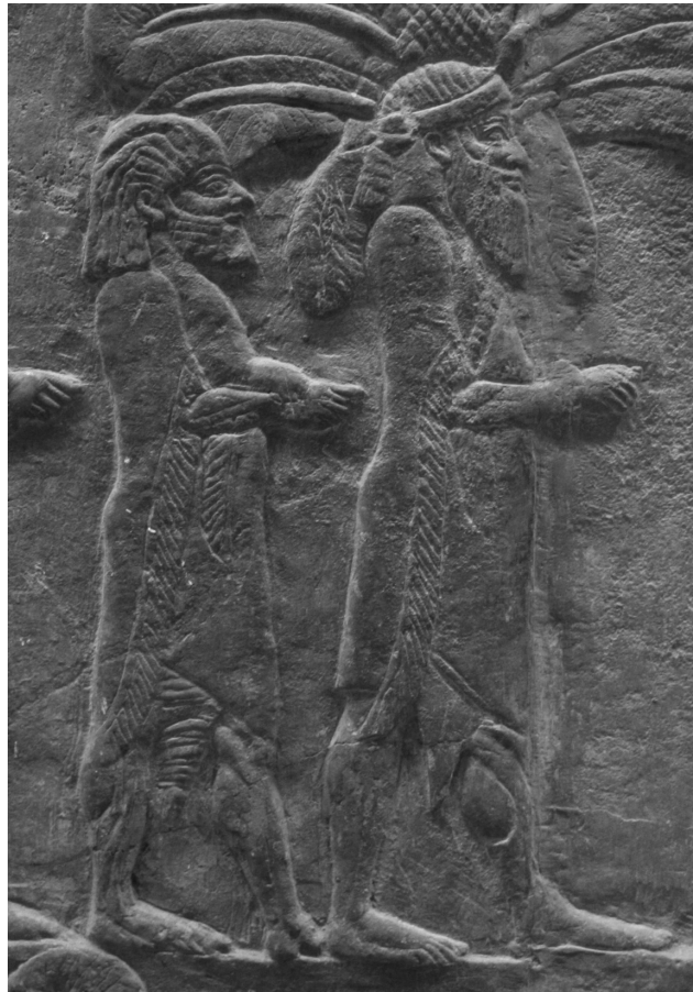
Fig. 6. The second and third foreigners. The middle row of BM ME 124946.