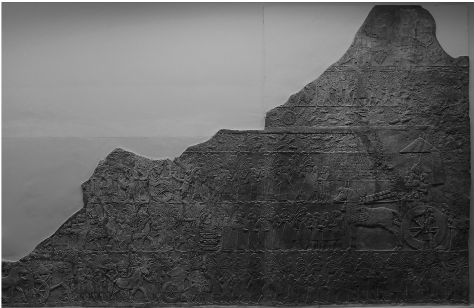
Fig. 2. Relief showing the presentation scene of Ashurbanipal. BM ME 124945–6 from Nineveh, North Palace, Room M, 127×195.6 cm and 213.4×147.3 cm. The British Museum.