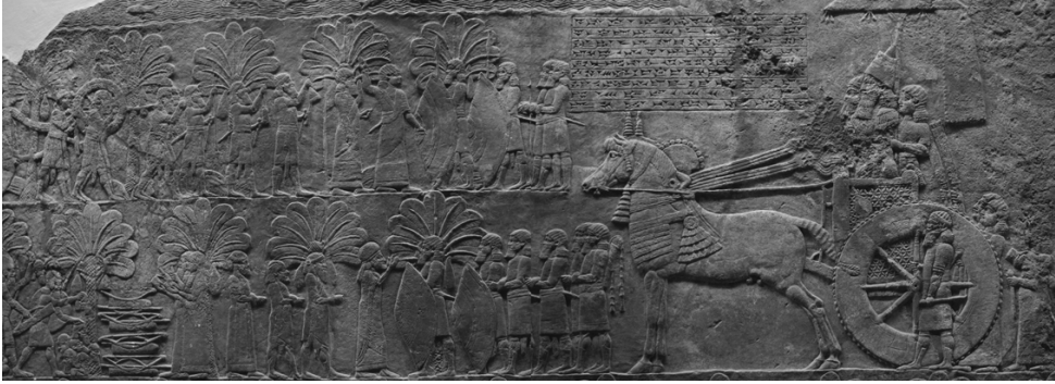
Fig. 3. Ashurbanipal reviewing war spoils from his chariot. The upper and middle rows of BM ME 124946.