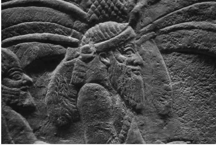
Fig. 5. The second foreigner. The middle row of BM ME 124946.