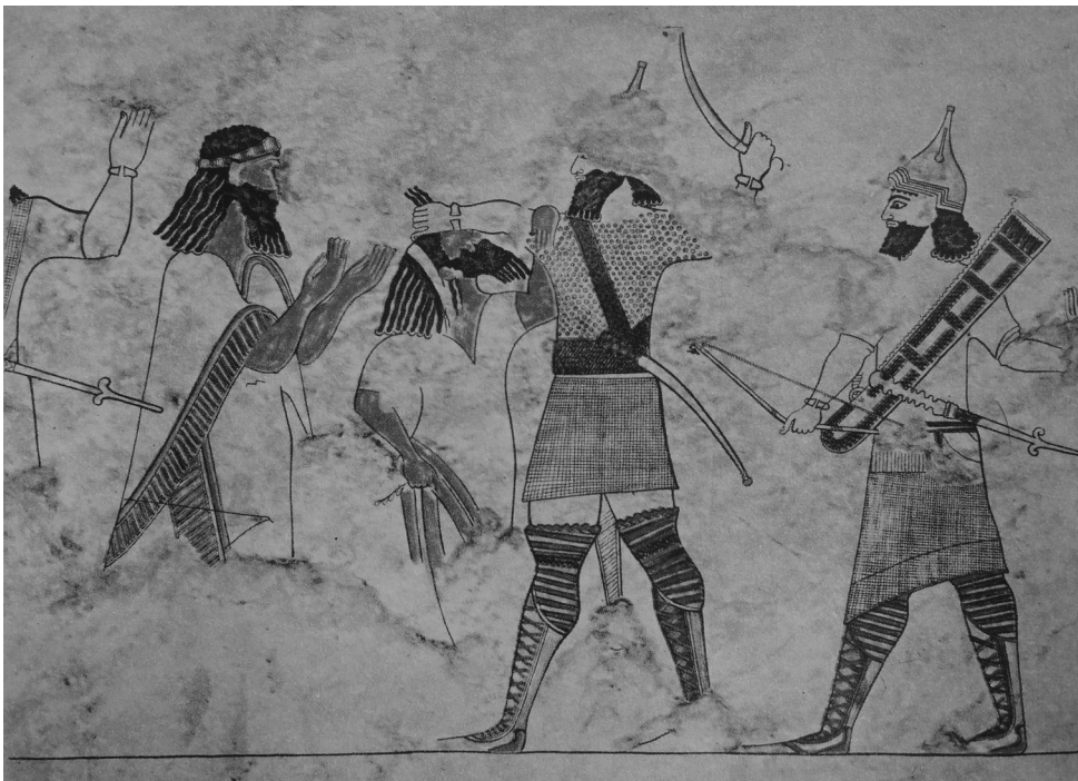
Fig. 8. The Arab represented on a wall painting discovered in the Assyrian palace at Til-Barsip. After Parrot 1961: fig. 116.