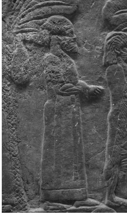
Fig. 13. The fourth foreigner. The middle row of BM ME 124946.