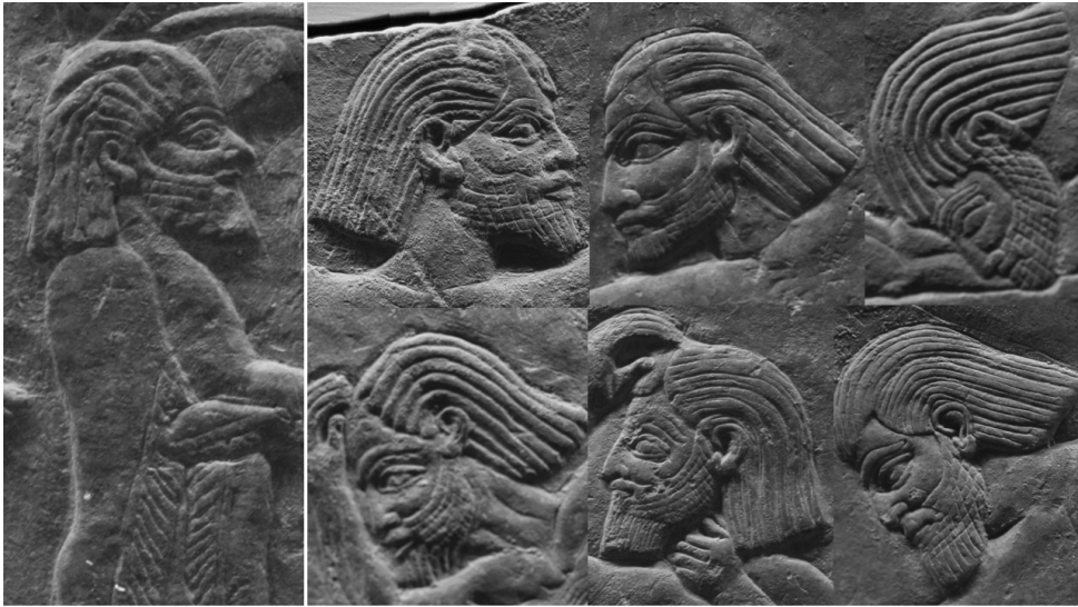
Fig. 7. The third foreigner (left) and the Arabs represented on reliefs from Room L, from Nineveh, North Palace, Room L. The British Museum.