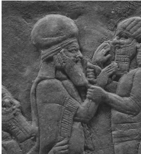
Fig. 10. The Elamite king (Ummanaldašu) with a long beard with vertically incised patterns. BM ME 124793, from Nineveh, North Palace, Room M or S 1 . The British Museum.