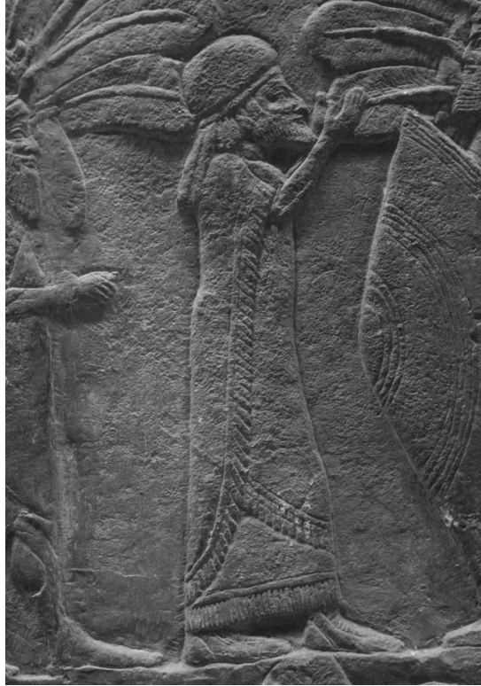
Fig. 9. The Elamite king (Tammarītu) standing in front of Ashurbanipal. The middle row of BM ME 124946.