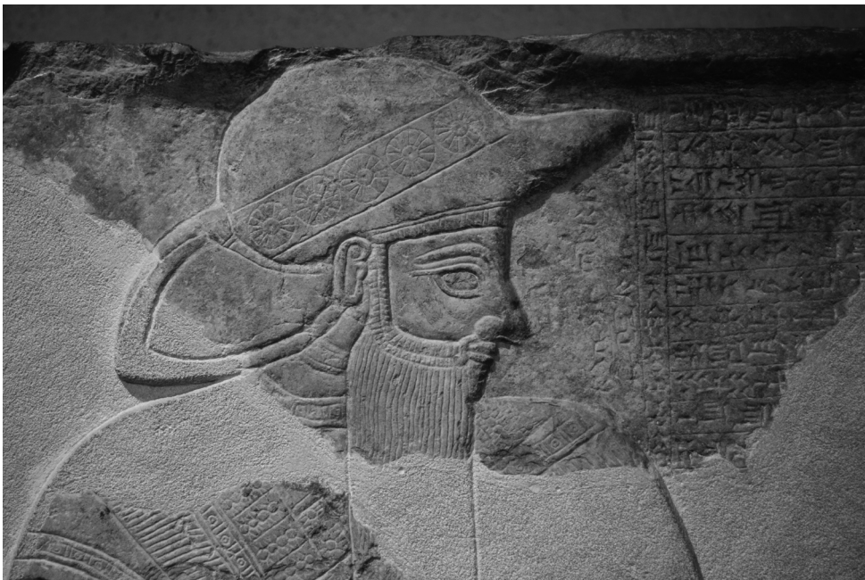
Fig. 12. A stele of the Neo-Elamite king Atta-hamiti-Inšušinak from Susa, ca. 645–520 BCE.