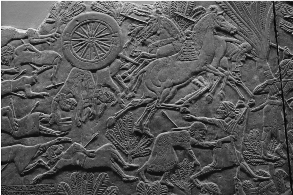
Fig. 14. The flight of the Elamite king, Teumman, and his son Tammarītu, from Room XXXIII, Southwest Palace, Nineveh, about 660–650 BCE. BM ME 124801c. The British Museum.