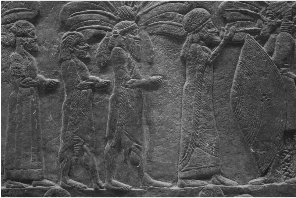
Fig. 1. Relief showing four foreigners paying homage to Ashurbanipal. BM ME 124946 middle row, from Nineveh, North Palace, Room M. The British Museum.