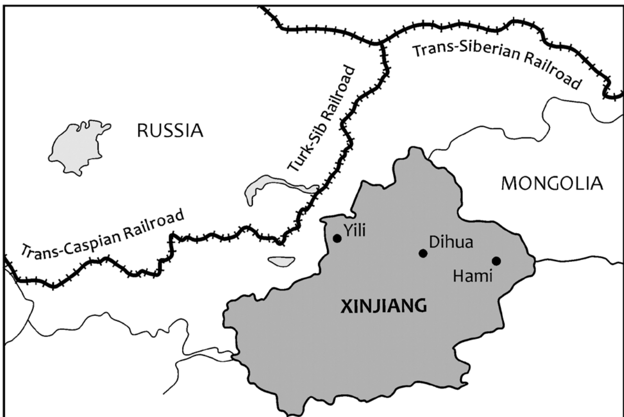
Map 2: Soviet Rail Network after 1928 (Cartography: Debbie Newell)

In stark contrast to central government officials in Nanjing and Chongqing, who proved largely unwilling to do more than pay lip service to the development of a road or rail network, foreign powers and the Russian empire and Soviet Union in particular, played a much more forward role in shaping the region's transport infrastructure. Following the expansion of their empire into Central Asia in the 1860s, Russian officials and merchants began to hear rumors about Xinjiang's lucrative resource wealth, from stories about gold nuggets dug out of river banks that were the size of a horse's hoof to reports about places in Xinjiang's arid northern steppe where raw petroleum bubbled out of the ground. The rumors prompted an outflow of Russian explorers, travelers, and geologists to Xinjiang in the latter half of the 19th century, and helped spawn an enduring interest in the region's resources, whether it was gold, furs, petroleum, or rare earth minerals.