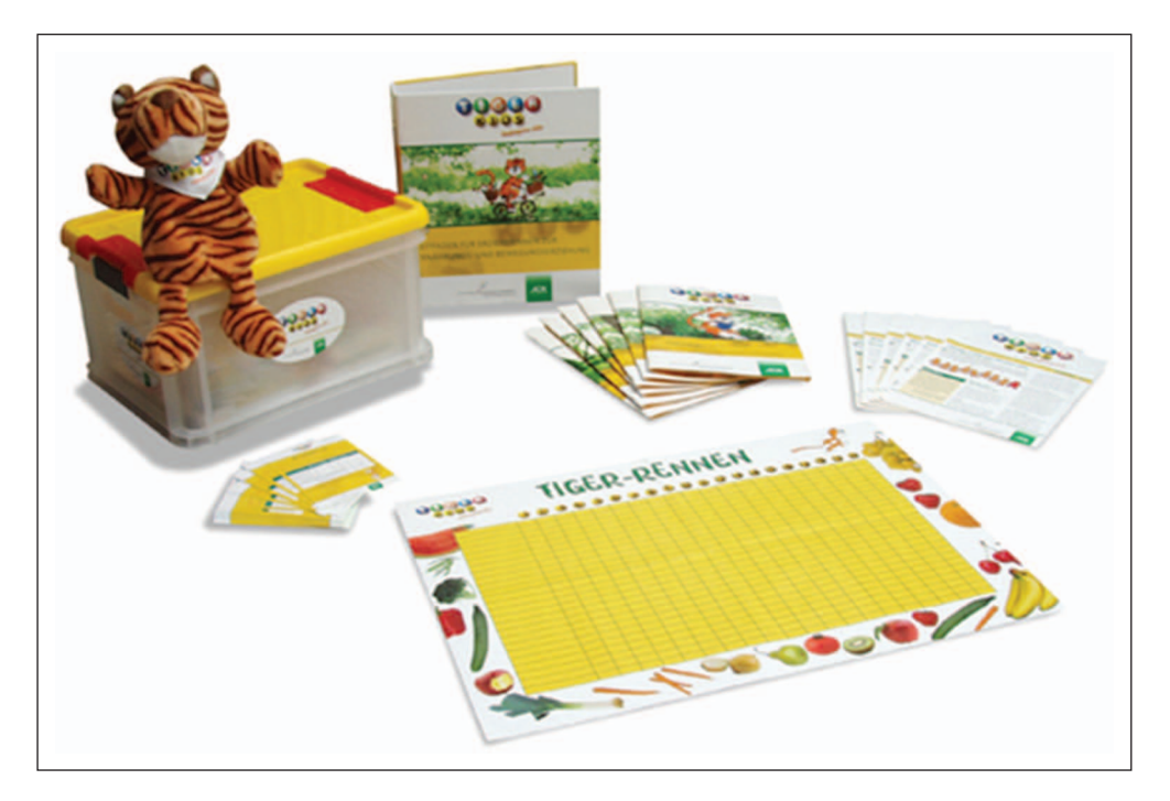
Figure 1. 'TigerKids' material box.