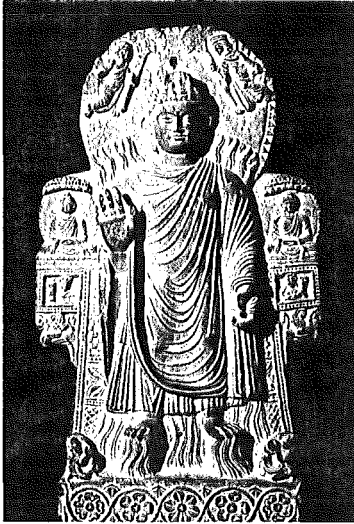
Buddha performing the miracle of Sravasti. 4 th Century B.C. Reproduction from Bérénice Geoffroy-Schneiter's book "Gandhara". With kind permission of Knesebeck Verlag, Munich

eight centuries A.D. With just one exception all these fragments are written in Indian languages and scripts. This shows that in the realm of literature Buddhism did not seek to adapt itself to local conditions, for instance by translating works brought from India into local languages, as was the case in China and Tibet. The oldest fragments probably date back to the first half of the first century, just at the beginning of the new millennium. This is absolutely sensational. Afghanistan can now lay claim to having preserved not only the