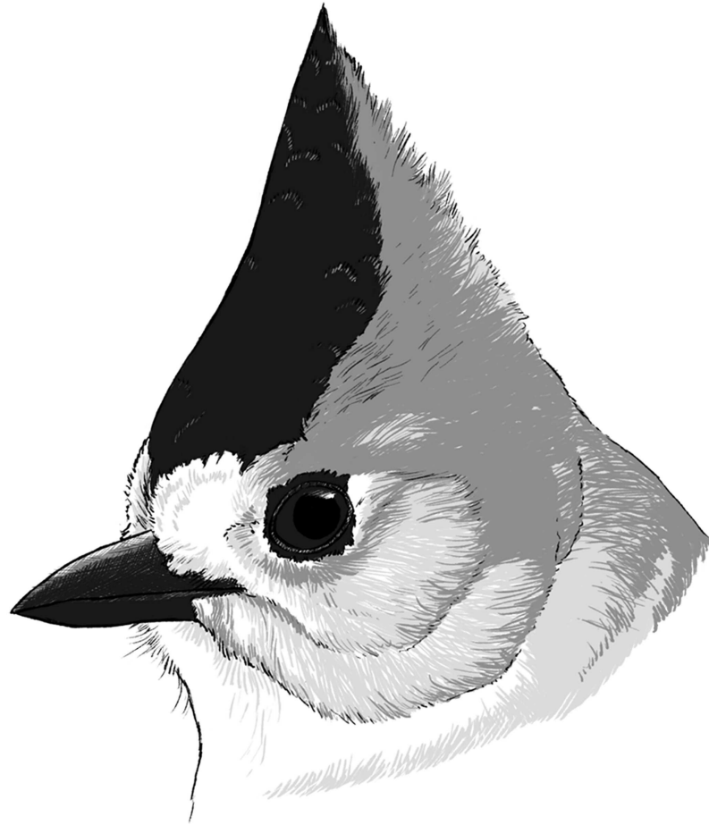
Fig 1. Crest of the black-crested titmouse, Baeolophus atricristatus .

https://doi.org/10.1371/journal.pone.0185584.g001