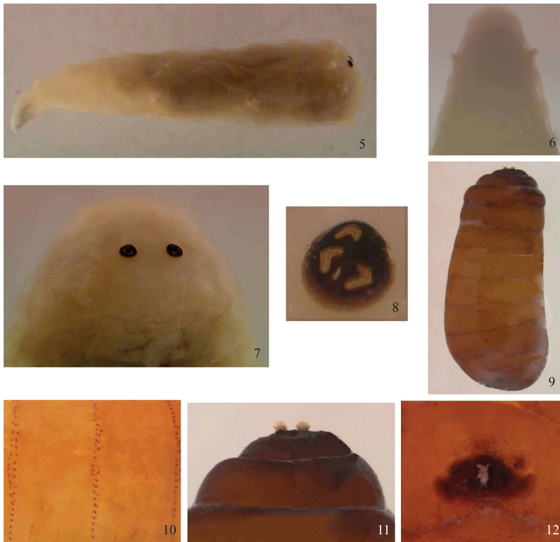
Figs. 5-12. Philornis fasciventris . Fig. 5) larva: general aspect; Fig. 6) larva: anterior end with anterior spiracles; Fig. 7) larva: posterior end; Fig. 8) larva: posterior spiracle and spiracular slits; Fig. 9) puparium: general aspect; Fig. 10) puparium: detail of spicules ; Fig. 11) puparium: anterior end; Fig. 12) puparium: caudal segment, anal region.

spiracles (closer to each other in P. aitkeni , separated by about the width of one spiracle, while in P. fasciventris they are separated by a distance of two spiracles). The arrangement of the spines and the shape of the posterior spiracular slits are also very similar.