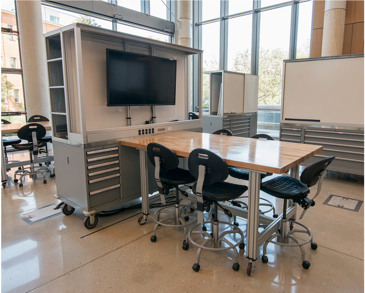
Figure 2. Design station and worktable