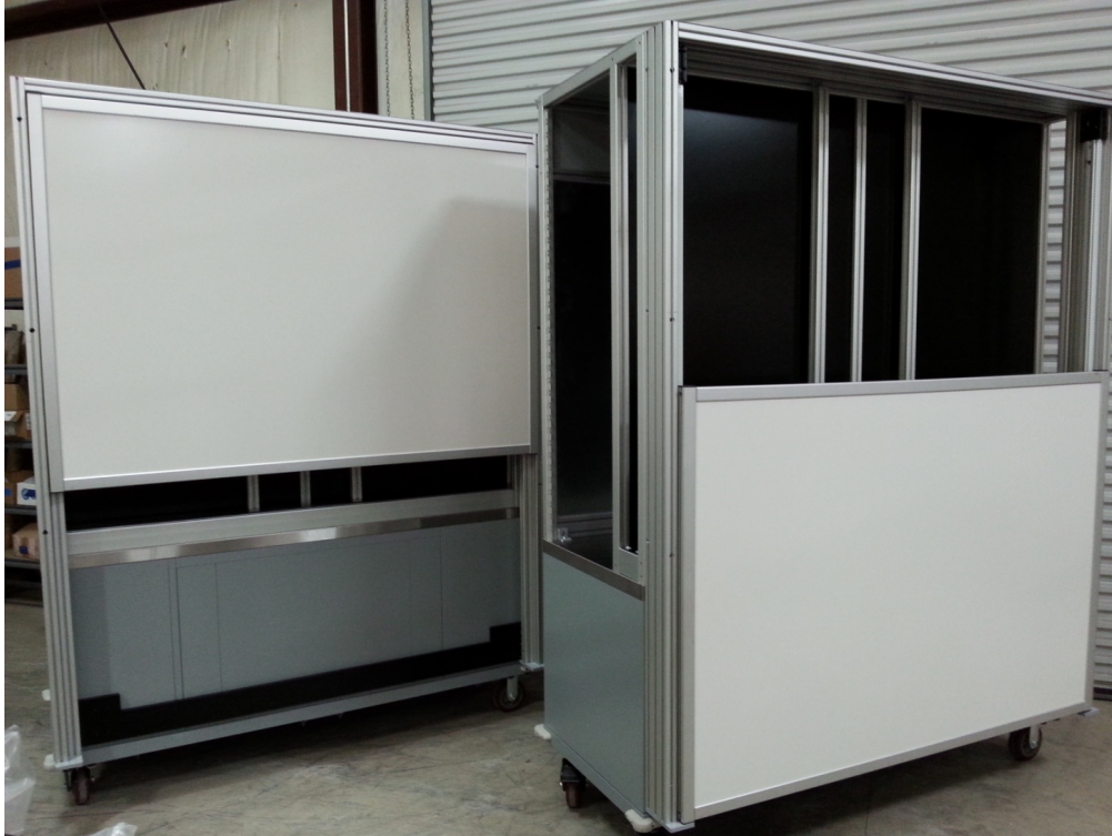
Figure 3. Two teaching walls showing one with whiteboard in the up position and the other in the down position. (Flat screen display mount is not yet installed on vertical center rails.)

Two teaching walls separate the lecture and presentation area (located in the northwest corner of the Innovation Center) from the group work area in the center. The teaching walls are constructed in much the same way as the design stations with a few exceptions. The overall dimensions of the teaching wall are 74" wide by 33" deep by 100" high. See Figure 3.