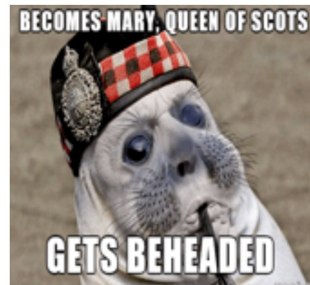
Scottish Situation Seal

However, she was executed for supposedly conspiring to assassinate Elizabeth.