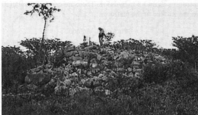
Fig. 5. Structure 1, a two-level pyramid platform.

This small, roughly rectangular platform measuring 12 m by 14 m, is located about 750 m southwest of the main site center. It is very well preserved and clearly constructed in the Megalithic style. On the southern end of the south wall of the