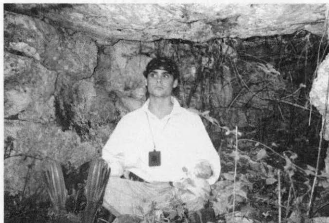
Fig. 6. The small square room in the Casa de Alux platform. (Photo: J. Mathews, 1995).

The site of Victoria is significant because, like Tumben-Naranjal, it represents a fairly well preserved Megalithic site in the eastern half of the peninsula. Although the Megalithic style appears to be well spread across the northern Yucatán Peninsula, it has not been well documented due to it being in a general state of poor preservation and covered with later architecture. At Victoria there appears to be only minor architectural modification most likely dating to the Late Postclassic period (Lorenzen 1995). This not only gives us a clear look at architecture from the Late Preclassic and Early