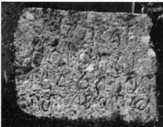
Fig. 4. Closeup of the stone plaque in the church façade at Victoria. The possible date of 1646 or 1846 is located inside the outlined rectangle. (Photo: taken from video by Scott Fedick, 1997).

construction style on the lower level allowed for a small vault to run under the stairs. I would estimate that there were 10–12 stairs on the first level and 7–8 stairs on the second level. On the upper level, there is evidence of a small collapsed shrine or room measuring approximately 3 m by 3 m. If this also parallels Structure 14, it would have been added on during the Late Postclassic (see Lorenzen 1995 for a discussion of Late Postclassic additions).