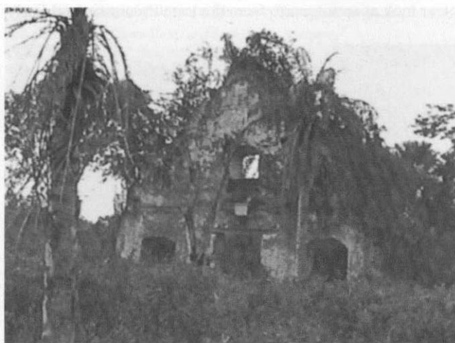
Fig. 3. The Colonial church at the site of Victoria. (Photo: taken from video by Scott Fedick 1997).

The frontal façade of the church faces west, and is the only full wall remaining, as the other three walls and roof, are almost entirely collapsed. The local village priest says that the roof caved in during the Caste War and that a perishable church was built inside of the original structure. The front façade contains one upper window approximately 2 × 2 m square and a smaller arched window located directly below. This smaller window is located directly above the plaque bearing a possible construction date. Below the stone plaque is an entranceway measuring a little more than a meter across with a wooden lintel that looks to be approximately .50 m wider on each side of the door. There are two round holes