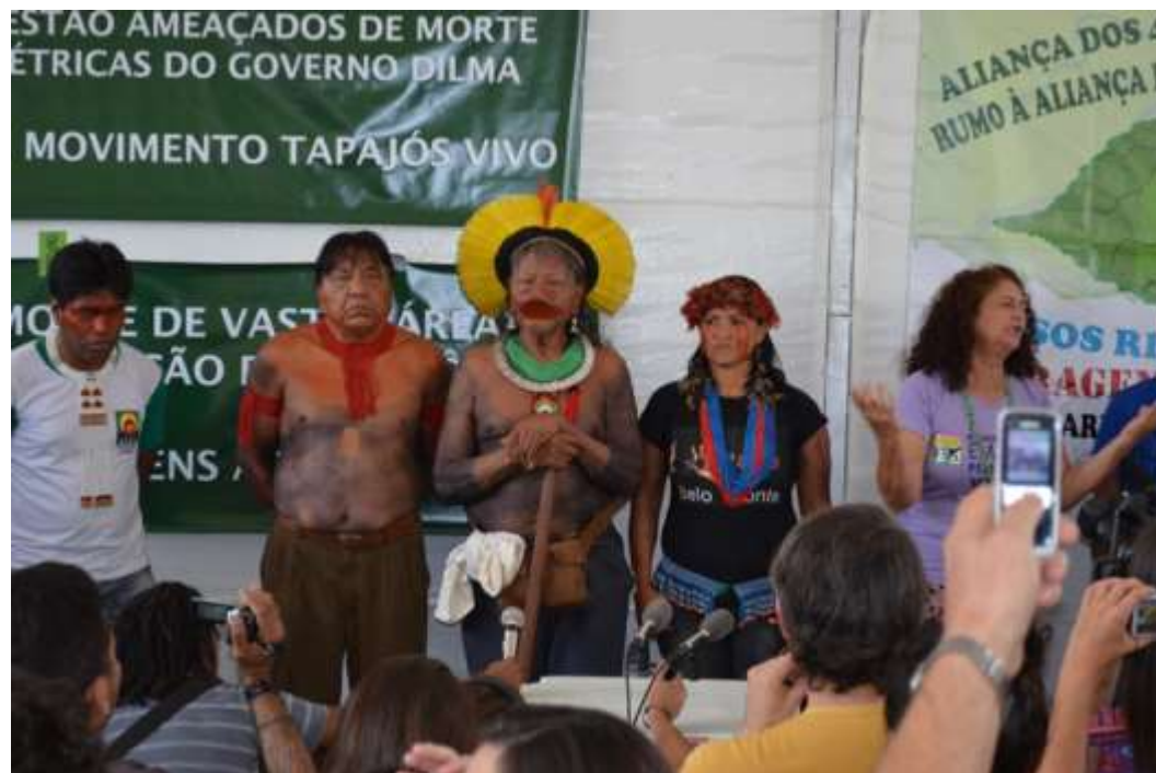
Figure 2. Raoni Kayapo, Sheyla Juruna and other indigenous and non-indigenous leaders at a manifestation against the placing of hydroelectric dams in the Amazon, held during the Rio+20 “Cúpula dos Povos” meeting in Rio de Janeiro.

Given the fact that cultural and biodiversity conservation go hand in hand, and that indigenous lands often form biocultural corridors, there is a perceived risk of accelerated “ecocide” of the Amazon along with the risk of cultural genocide brought by development and accelerated growth (Schwartzman et al. 2013; Loh and Harmon 2014). In this context, multi-scale and multi-actor resistance to large-scale development projects in the Amazon have played a critical role in unsettling power relations and fostering human and environmental justice in Latin America’s biggest democracy (Gledhill 2012).