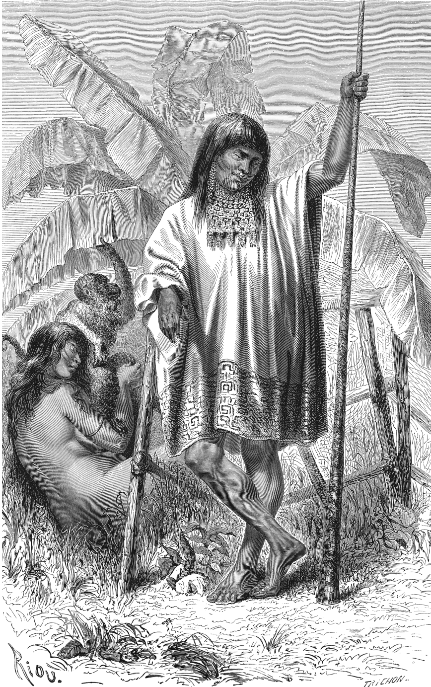
Figure 2: Conibo warrior with captive woman, mid-1800s.