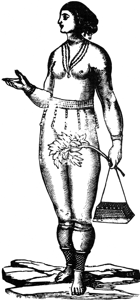
Figure 1. Kalinago high-ranking woman, 1600s.

forced—at least during the years immediately after their capture—to lead a limbic life of alienation and marginality.