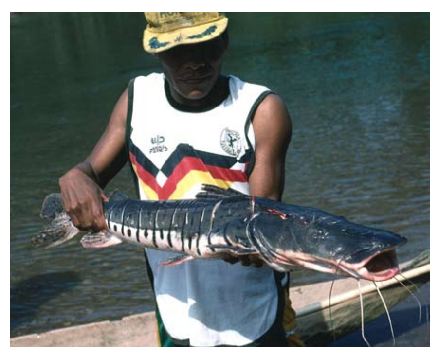
Figure 7. A crew member holding an ino huahuin (tiger catfish) that he speared

Just before reaching our last upper Pisqui campsite at the crossing point, I faced a possible mutiny when I discovered that the crew had shot a maquisapa (black spider monkey) against my instructions not to kill the animals unless necessary for self-defense. They had encountered an aggressive and threatening tapir with no fear of humans on an earlier trip without me and had resorted to killing it with stones because the shotgun did not work. This time, though, there was no real danger. There was plenty to eat, because I had paid for and brought provisions, and we were leaving uneaten fish behind. The dead maquisapa hung on a branch high in the tree and the crew was going to cut down the tree to get it so they could eat it. "Nope," I said, "I'm paying for the ammunition and this is against the rules. Leave the monkey." Their obvious, sullen anger made