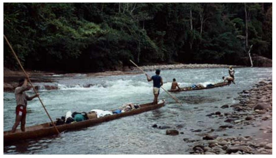
Figure 10. Poling up rapids on Pisqui, second expedition (1992)

The next year, I organized another expedition with the intention of exploring Huiãn Caibima. I wanted to see if we could use my original plan of following the creek up the drainage until we could climb the low pass separating that drainage from the valley in which we knew Tashi Manãn to be. I hired a missionary pilot to fly me and my expedition gear into Nuevo Eden. My crew with my boat (a dugout canoe with a roof) was to come up the lower Pisqui and meet me at Nuevo Eden. Part of my crew would go up the Pisqui from Nuevo Eden with me.