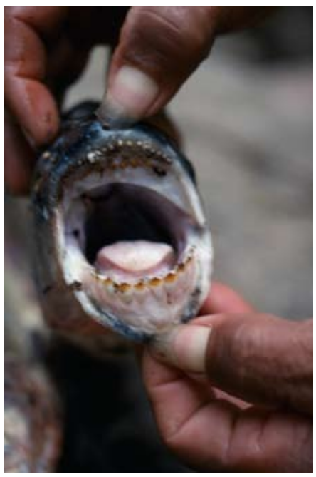
Figure 11. A seriously carnivorous fish

About two kilometers above our camp, we came to a series of extremely difficult passages involving large boulders, waterfalls, and deep pools. The river made a sharp bend upriver to the west, and it was obvious that there were periodic flash floods with depths of ten to twenty meters. Just below a narrow trench through which the river flowed, the men left me to fish while they explored ahead to look for a place to camp for the night. Although I had brought wire leader, I found myself struggling to haul in large trout (fifty to sixty centimeters) with large, sharp teeth. Some of them bit right through the steel leader. There were large schools and several species of fish, some of them sharp-spined catfish.