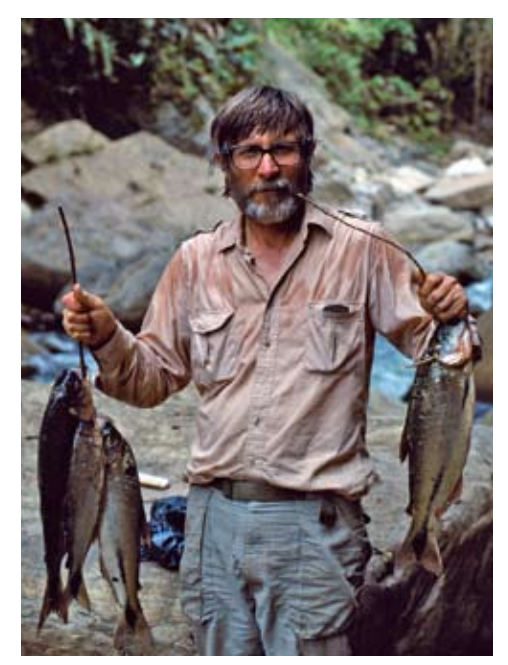
Figure 14. Author with a good catch for the afternoon on upper Huiān Caibima

water. When they returned to the camp, they said it was impossible to go further. The south bank, on which we were perched for the night, looked to be sheer rock cliffs for some ways up the valley. That night, Benjamin assigned one person in rotating shifts to watch for jaguars coming into the camp since we could not hear anything over the roar of the water.