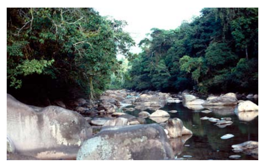
Figure 15. Upper Pisqui, main channel, August dry season