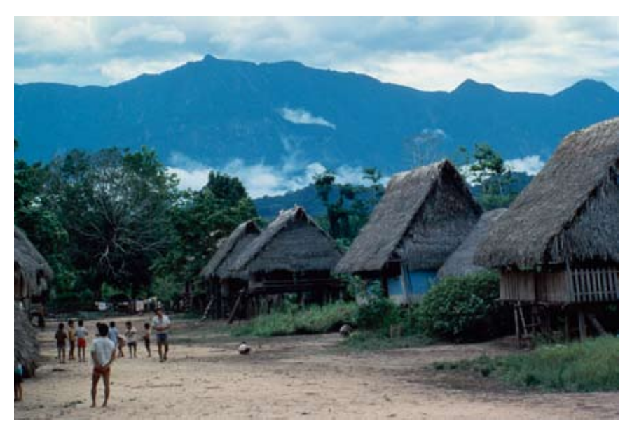
Figure 3. The village of Nuevo Eden with Mananshua Manān in the distance. Village location: 8° 25' 57.80" S, 75° 43' 43.2"W c 260 m

Thefirststoponthejourney was the village of Nuevo Eden, where, on several occasions from 1984, I had worked as a physician and epidemiologist conducting ethnographic and demographic research (Hern 1992a, 1992b, 1992c). Nuevo Eden is located about twenty kilometers from the base of a spectacular mountain range, the Cordillera Azul, which rises abruptly from the western edge of the Peruvian Amazon. According to topographic maps and my transit measurements,