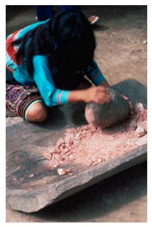
Figure 2. Grinding salt from Tashi Manãn

contact. The Shipibo informed me that their ancestors had managed a brisk trade in salt, stones (unavailable on the Ucayali flood plain), and certain clays used for painting.