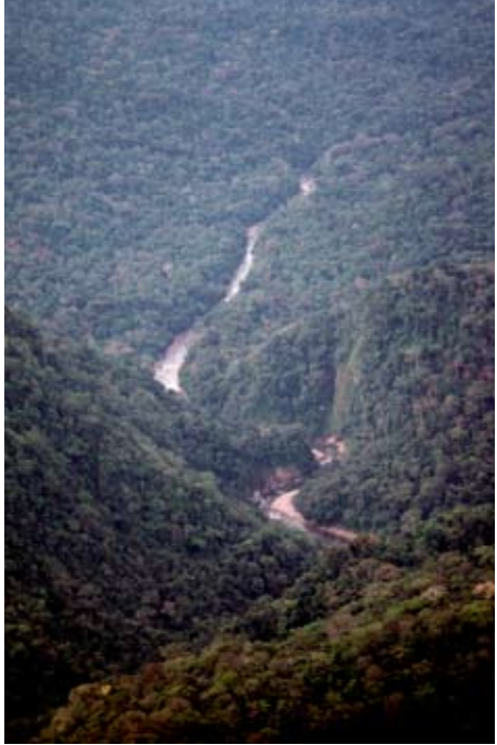
Figure 8. Headwaters of Pisqui at the crossing to Huiãn Caibima

None of my Shipibo friends had ever seen a map, so they could not interpret the materials I had. At each point on our trek up the river from our base camp, I had followed the topographic map and had taken bearings