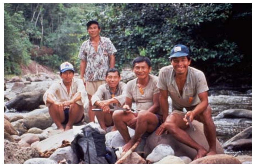
Figure 9. My crew on the day of discovery of Huiãn Caibima

The next year, I organized another expedition with the intention of exploring Huiãn Caibima. I wanted to see if we could use my original plan of following the creek up the drainage until we could climb the low pass separating that drainage from the valley in which we knew Tashi Manãn to be. I hired a missionary pilot to fly me and my expedition gear into Nuevo Eden. My crew with my boat (a dugout canoe with a roof) was to come up the lower Pisqui and meet me at Nuevo Eden. Part of my crew would go up the Pisqui from Nuevo Eden with me.