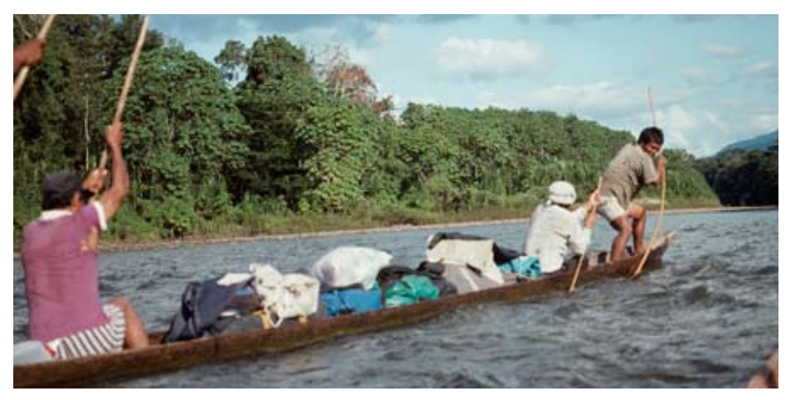
Figure 4. Poling up the Pisqui in a dugout canoe

the summit of the highest peak visible from Nuevo Eden, "Mananshua Manãn" (Turtle Mountain) is 1,434 meters, whereas the elevation of Nuevo Eden is about 260 meters above sea level.