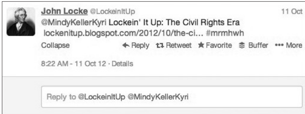
FIGURE 2: Screenshot of Twitter Response with Link to Blog Post

questions to encourage further analysis or clarification, or did so face-to-face if he deemed it more appropriate. Students benefitted from immediate feedback that can be difficult via other mediums. While this activity was meant to last only one class period, another 20 minutes was needed the following day to debrief what took place.