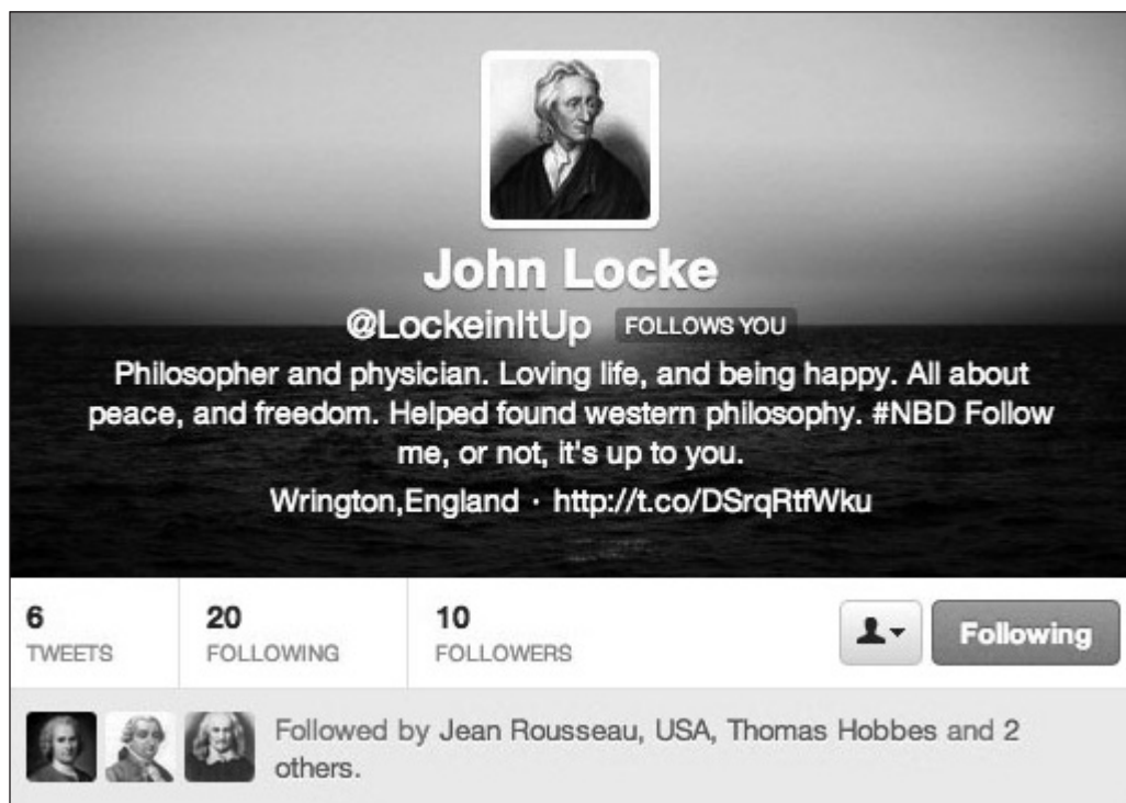
FIGURE 1: Screenshot of Twitter Profile