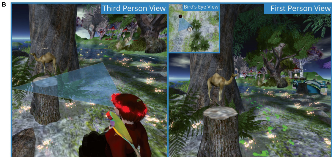
FIGURE 1 | (A) A limited showcase of currently available VR technologies. Devices are sorted as a function of their ability to provide the participant with a sense that they are "in" a virtual environment (immersiveness; x -axis) and the system's affordability ( y -axis). "Window on World" refers to a traditional desktop and monitor setup. CAVE = cave automatic virtual environment – a real world room that leverages projectors and motion capture to create room-size virtual experiences. MR-safe equipment (joystick and buttonbox: Current Design, Inc., Philadelphia, PA, United States, goggles: cinemavision.biz) can be used during MR scans. (B) Examples of common perspectives presented to participants while actively navigating VEs or during spatial memory tests. Both first- and third-person viewpoints provide an egocentric perspective whereas a bird's eye view provides an allocentric one.