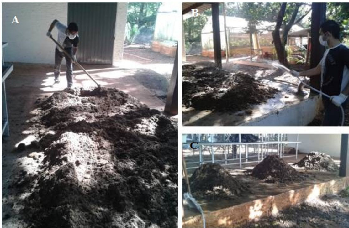
Figure S1. Assembling of composting piles using residues from sugarcane milling (Pressmud). Mixing (A), watering (B) and separation of the three composting heaps examined in this study (C).