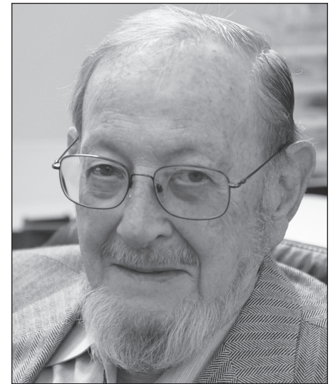
Gerald J. Wasserburg