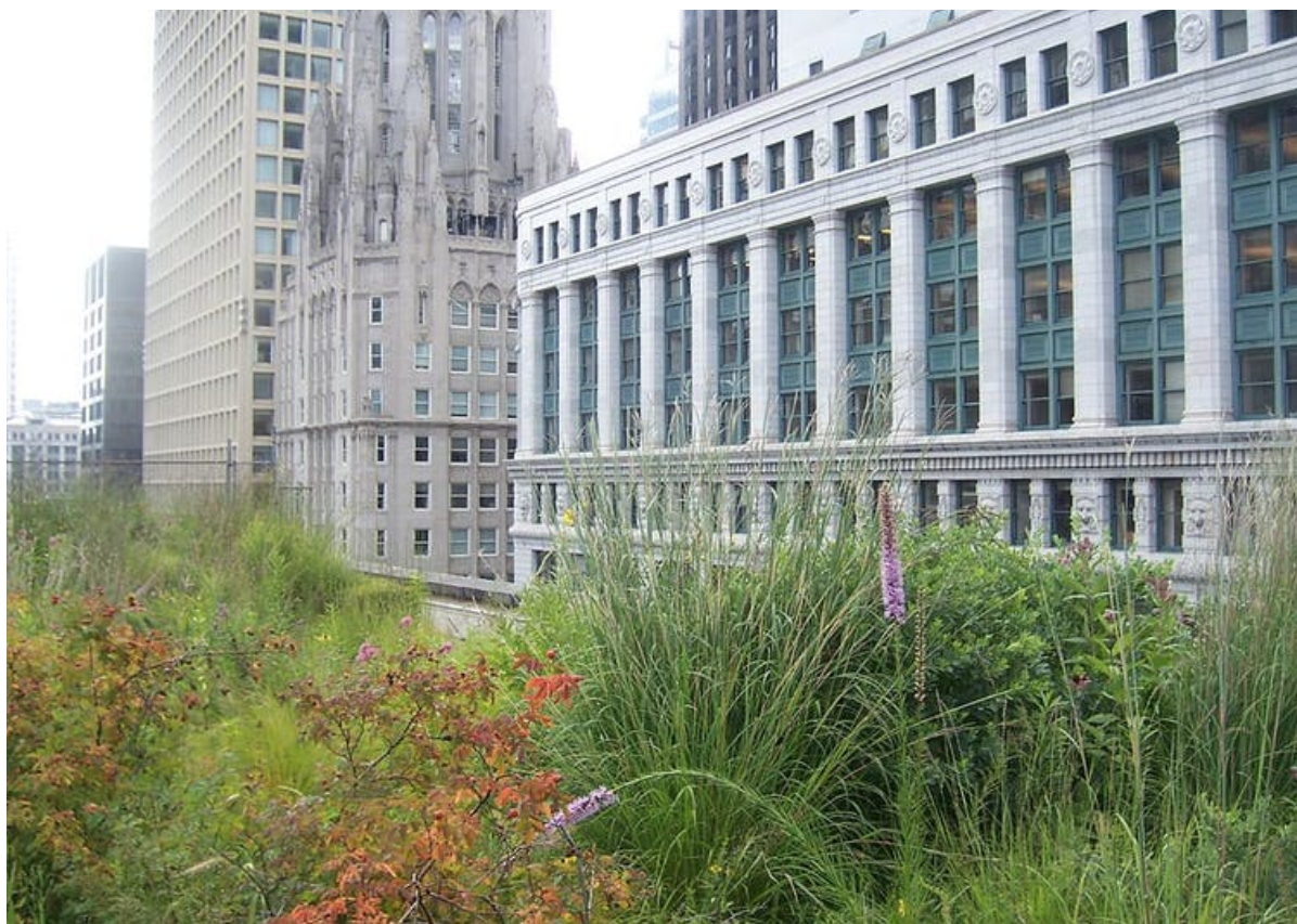
Green roof on Chicago's City Hall.