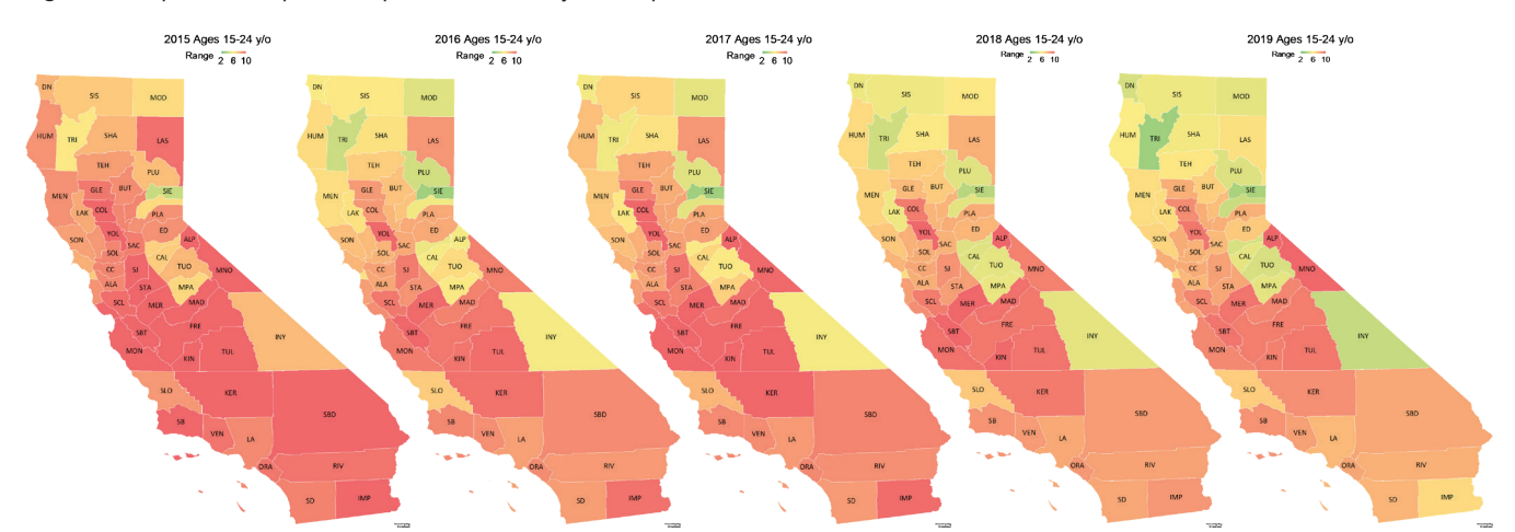
Figure 2. Proportion of opioids dispensed to 15-24 year old patients.<sup>(16)*</sup>

*Proportions calculated as opioids dispensed to 15-24 year olds among total opioids dispensed per respective counties in California from 2015 to 2019.