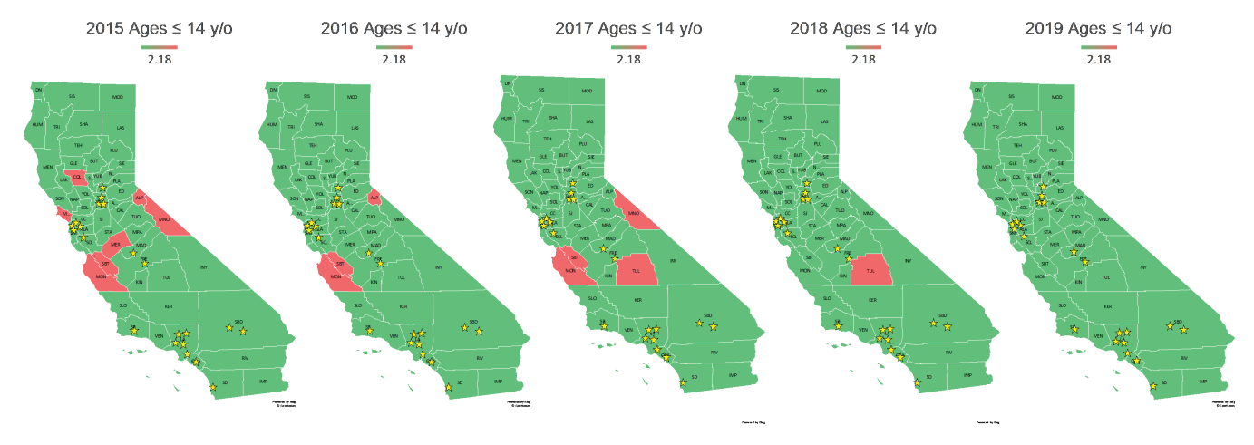
*Children hospital or specialty clinics were based on the information from the Children's Hospital Association.<sup>(17)</sup> "High-rate" counties were defined as counties that were one standard deviation above the average opioid dispensing rate in 2015.

opioid prescribing may have contributed to the drop in opioid dispensing rates following the 2017 rebound. Similar reductions in opioid use were also observed in other studies which examined state opioid prescribing rates after the implementation of a prescription drug monitoring program (PDMPs).<sup>(22,23)</sup> Studies have also demonstrated a reduction in the prescribing of schedule II opioids after mandating registration to PDMPs.<sup>(24)</sup> While the initial intent of a PDMP is to reduce the number of prescriptions given to high-risk drug abusers by identifying patients who regularly fill controlled substances, there may have been a secondary effect where prescribers and dispensers adjusted their overall prescribing and dispensing practices due to the heightened awareness of PDMPs.