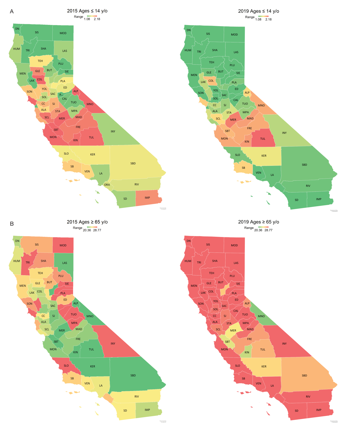
Figure 3. Comparison of opioids prescriptions among different age groups in 2015 and 2019 from data collected by DOJ.<sup>(16)*</sup> A) \leq 14 years old; B) \geq 65 years old.

*Proportions calculated as opioids dispensed to the age group of interest per total opioids dispensed within the county.