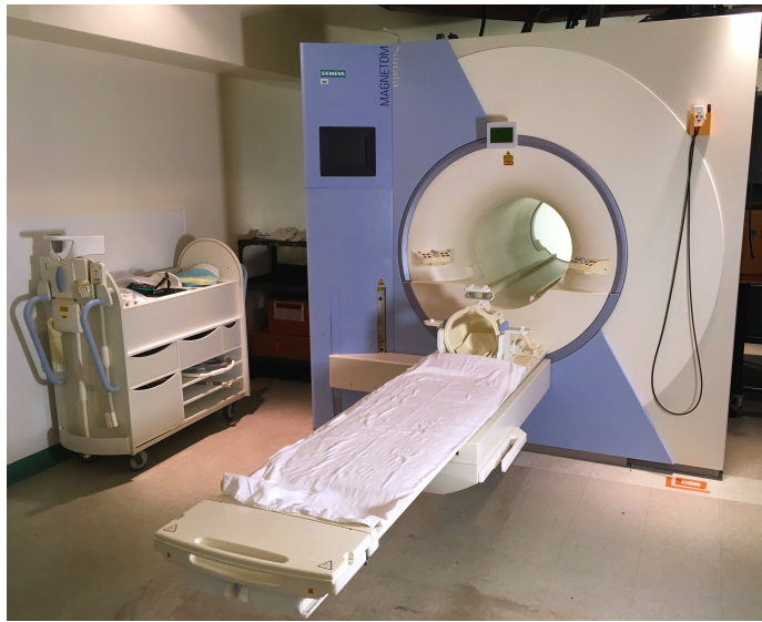
Figure 1: Decommissioned Siemens 1.5T MRI used for the neurosuggestion procedure.