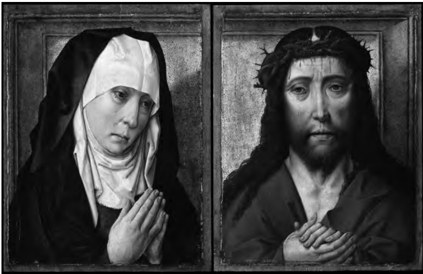
Figure 4. Copy after Dieric Bouts, The Mourning Virgin ; The Man of Sorrows . Courtesy of the Metropolitan Museum of Art, 71.156–57.