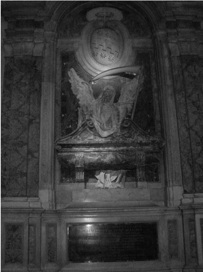
Figure 2. Carlo Bizzaccheri, Tomb of Cinzio Aldobrandini, S. Pietro in Vincoli.