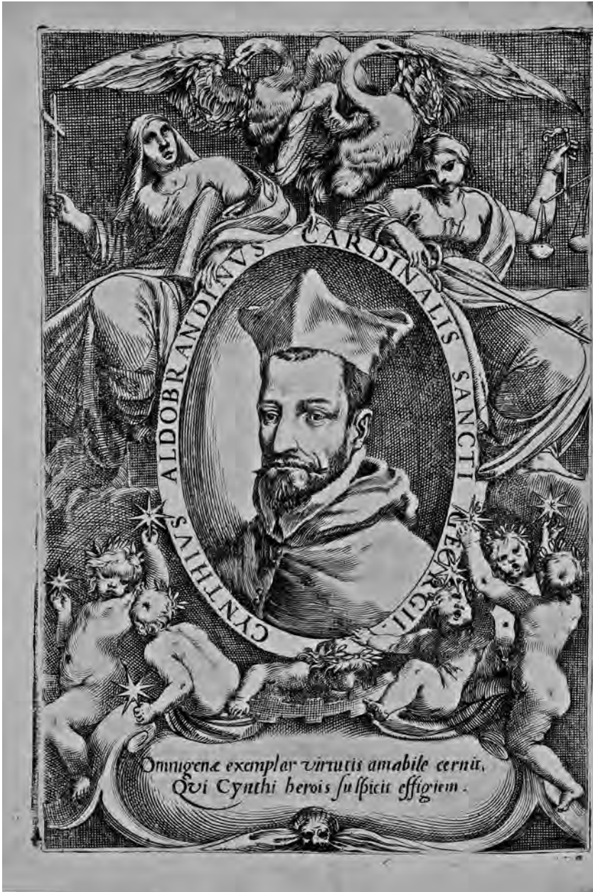
Figure 1. Detail, frontispiece of the Tempio all'illustrissimo et reverendissimo Signor Cynthio Aldobrandini, Cardinale S. Giorgio, nipote del Sommo Pontefice Clemente Ottavo , ed. Giulio Segni (Bologna, 1600).