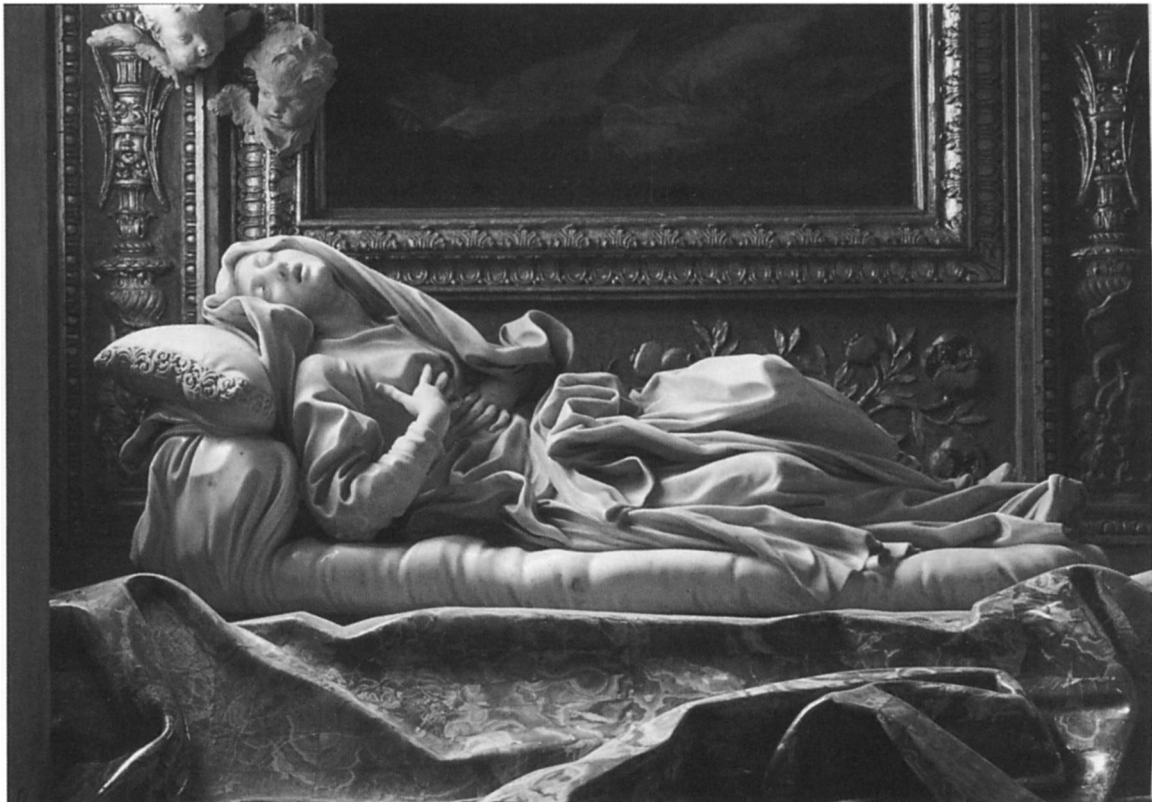
Fig. 8. Gian Lorenzo Bernini (Italian, 1598–1680). Beata Ludovica Albertoni , 1674, Carrara marble, 90 × 210 × 80 cm (35.4 × 82.7 × 31.5 in.). Rome, San Francesco a Ripa, Cappella Altieri.

Baciccio’s Ludovica appears younger than Bernini’s—the painting shows the beata at an earlier point in her life, presumably just after her husband’s passing but well before her own body was distorted by ecstasy or death. 44 Yet these two depictions of Ludovica have significant commonalities. In both depictions of the beata, her silhouette is defined by the long sinuous line of the veil that runs from the crown of her head to her