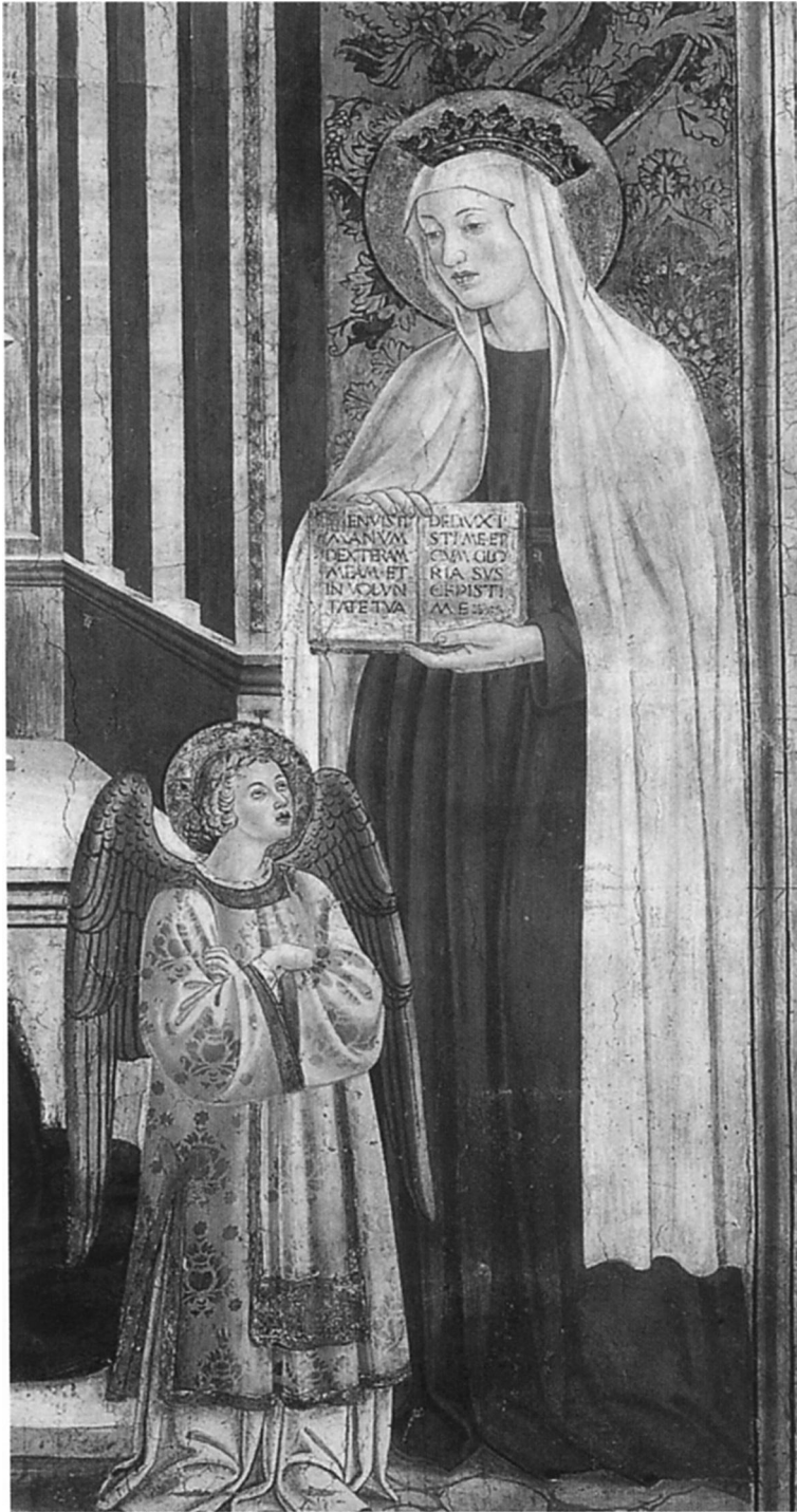
Fig. 2. Antoniazzo Romano (Italian, before 1452–between 1508 and 1512) and studio. Santa Francesca Romana (detail), 1468, altar fresco. Rome, Monastero di Tor de' Specchi.