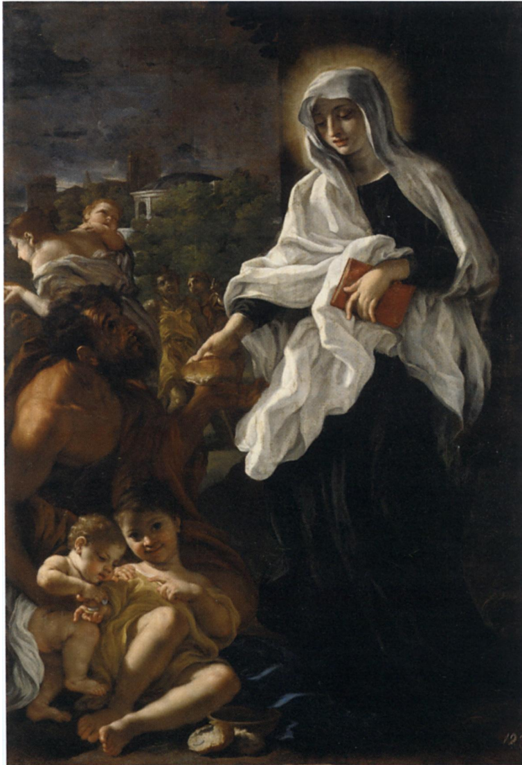
Fig. 1. Giovanni Battista Gaulli, known as Baciccio (Italian, 1639–1709). Saint Francesca Romana Giving Alms [here identified as Beata Ludovica Albertoni Distributing Alms ], ca. 1675 [here dated 1671], oil on canvas, 210.2 × 137.2 cm (82¾ × 54 in.). Los Angeles, J. Paul Getty Museum (70.PA.30)

angel, her constant attribute, and this omission should have raised questions about the identification of the figure. 3 The key iconographical element in this painting is instead the bread, which, as seen in the center foreground, is studded with coins. 4 The eldest child, who is the only figure to look directly out of the painting and engage the viewer, calls attention to this detail by pointing to several silver pieces that she holds in her right hand. A younger brother clambers up to grab at them. The coin-studded loaf of bread is a standard iconographical attribute of the Beata Ludovica Albertoni, a Franciscan tertiary who was noted for her charity and beatified in January 1671 by Pope Clement X Altieri (reigned 1670–76). 5