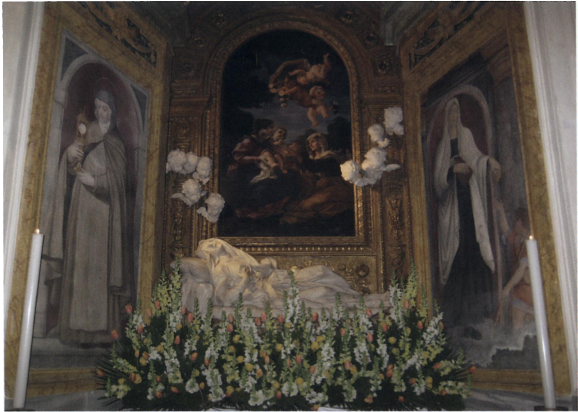
Fig. 3. Cappella Altieri, San Francesco a Ripa, Rome on the feast day of Beata Ludovica Albertoni, 31 January 2009.