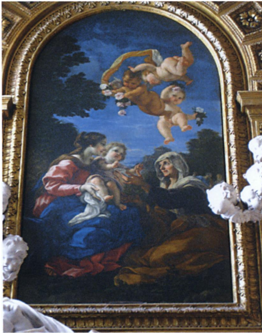
Fig. 7. Giovanni Battista Gaulli, known as Baciccio (Italian, 1639–1709). The Holy Family with Saint Anne, 1674, oil on canvas, 242 × 133 cm (95.3 × 52.4 in.). Rome, San Francesco a Ripa, Cappella Altieri.

Ponte Sant'Angelo. 37 Baciccio's success in his own time, and his continued fame in our own, are closely tied to Bernini.