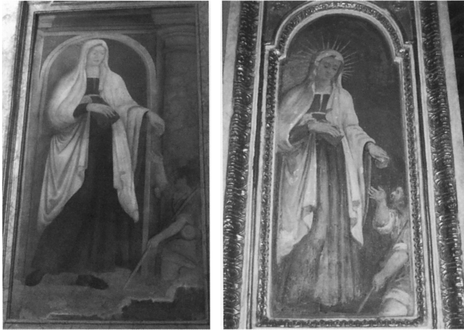
Fig. 4. Ludovica Albertoni , 16th century, fresco. Rome, San Francesco a Ripa, Cappella Altieri.