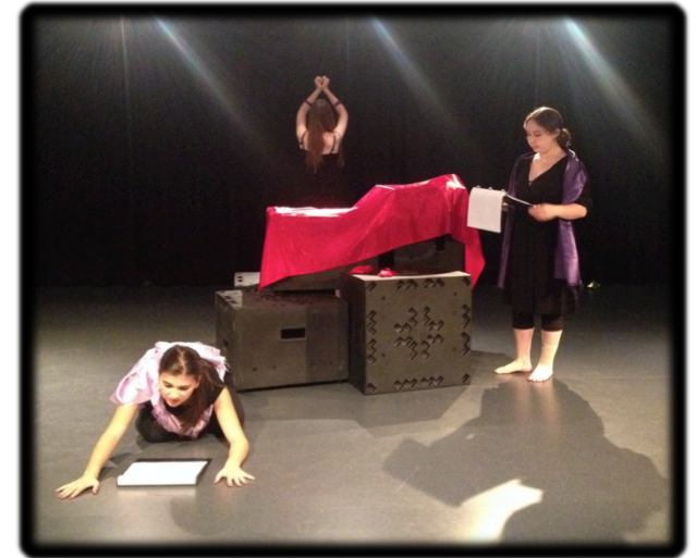
Trojan Whores rehearsal

The director is a storyteller. They must conceive of the overall vision, guide and collaborate with others in order to achieve this vision, synthesize all creative input into cohesion, and make the story relevant to its audience community.