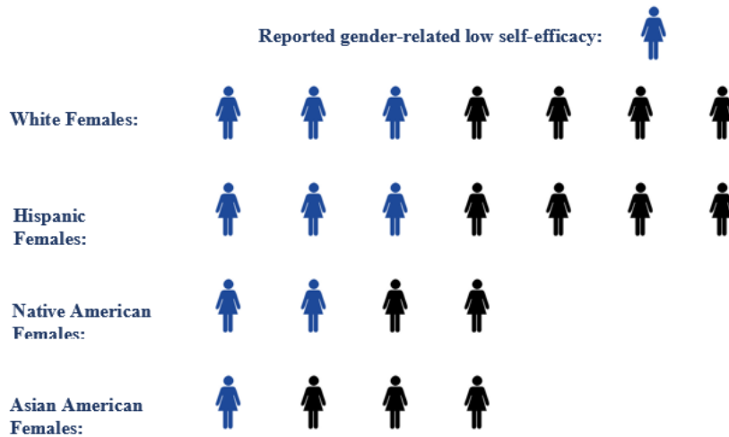
Dispersion of Female Interviewees in Varma's Study (2002)