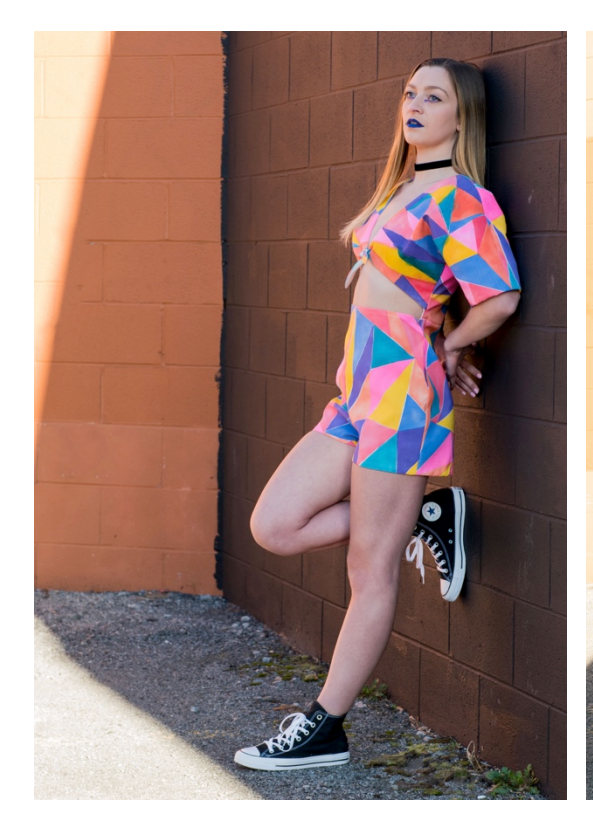
Look One Look Two

surface designs for them and then have those designs printed onto the fabric used to make the garments. This process helped me to develop as a designer and gain more skills that will be helpful in the professional world. I am grateful to have had this experience and look forward to presenting it to an audience at the senior fashion show on April 27th.