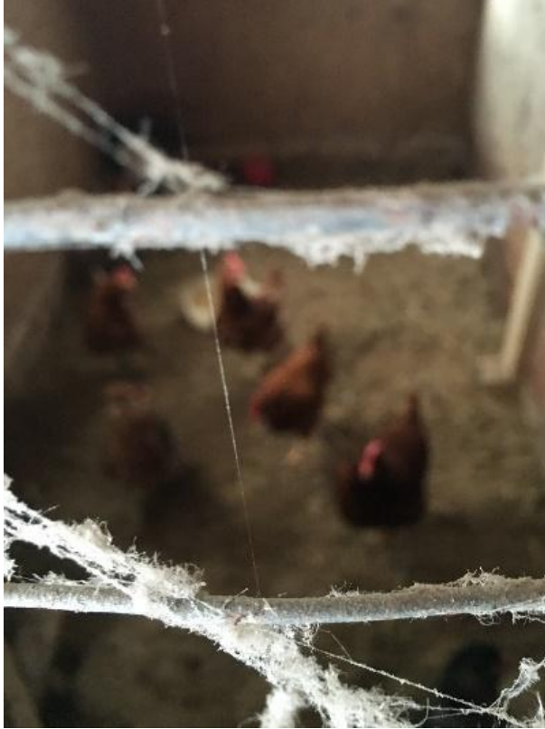
Figure 2: Latefor's pictorial memoir. She represents herself in a picture of her chickens in a stall with ancient chicken wire in the foreground.